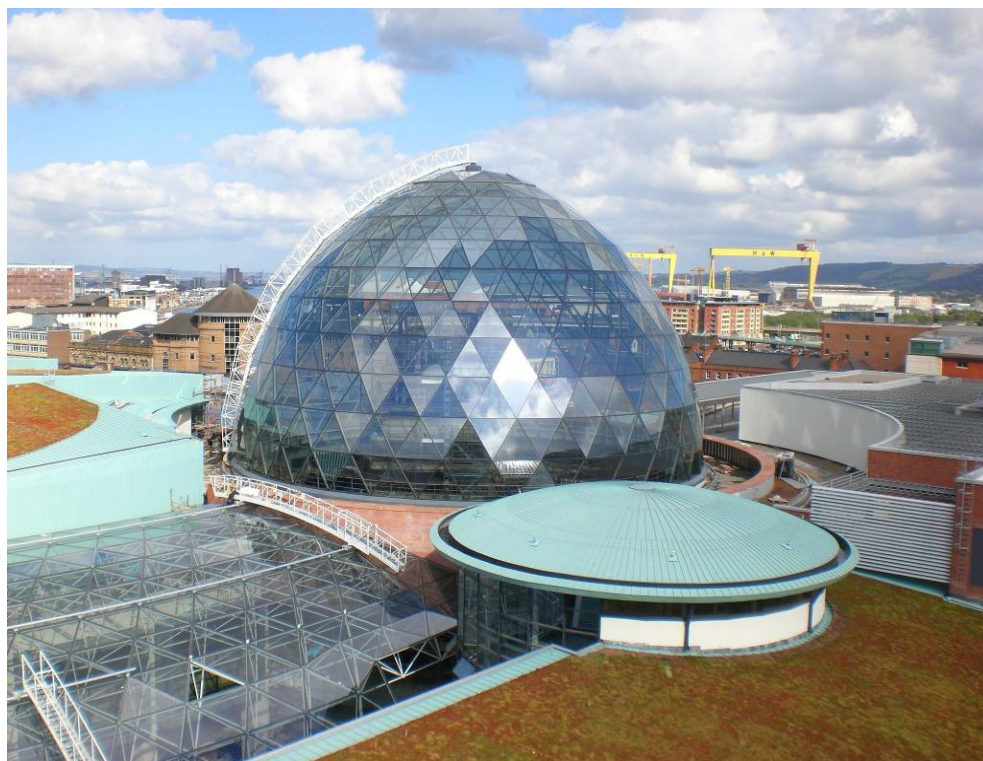
Figure 8: Victoria square dome in Belfast. Single layer glass grid shell.

For this project and the followings LANIK developed an own joint system called SLO, Single Layer ORTZ, specially designed for single layer grid shells. This is another tendency, to design new system of connection for the new kinds of structures the market requires.