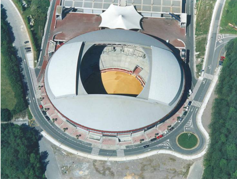
Figure 4: San Sebastian bullring retractable roof.

concealed position, leaving the opening clear. These segments roll back and forwards in a curving motion.