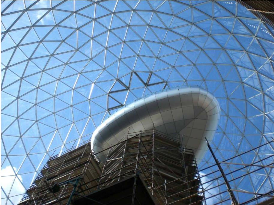
Figure 9: Victoria square dome in Belfast. Inside view. Transparency.