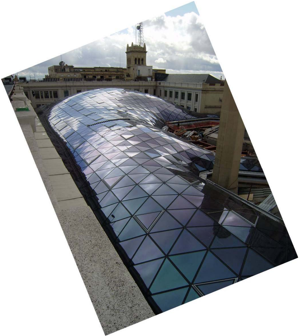
Figure 10: Palacio de comunicaciones. Town hall of Madrid. Free form structure.