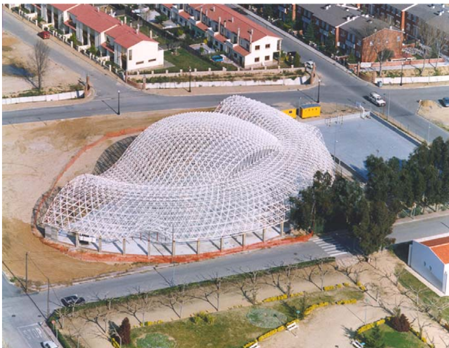
Figure 3: Palafolls Sports Centre. Complex geometry. All elements are different.