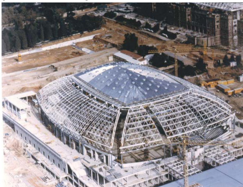
Figure 2: Palau D'Esports Sant Jordi during erection. Complex geometry.