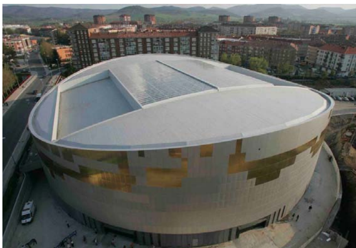
Figure 6: Vitoria bullring. Outside view.