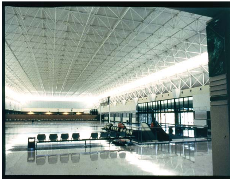
Figure 1: Las Palmas de Gran Canaria airport. Square module. Only two kinds of bars.