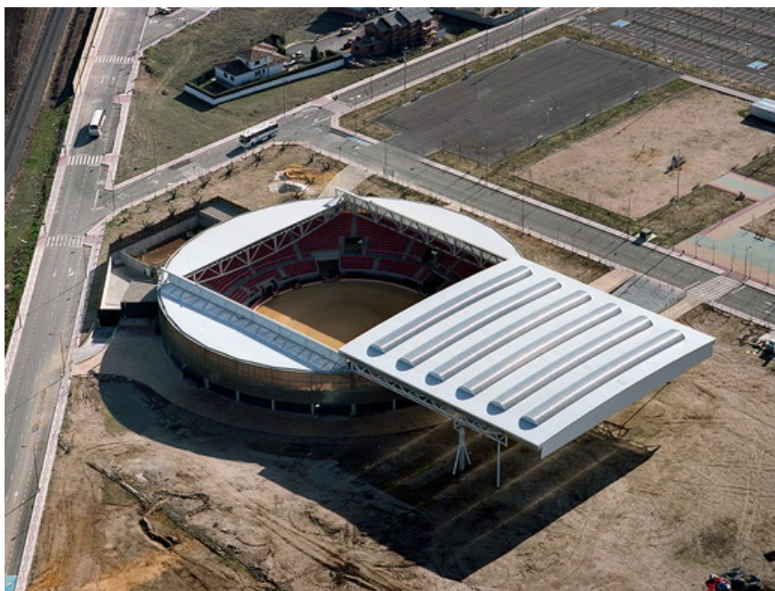
Figure 7: Illescas, Toledo. Bullring mixed retractable roof structure.

This is an example of the new tendency in roof structures, the combination of several kinds of structures, a main conventional structure with parts of space frame filling the whole area. Another mixed structure and retractable roof example is the new bullring roof in Illescas, Toledo, where a 2600 square meters mobile structure opens or closes to the air the entire bullring as it is shown in figure 7.