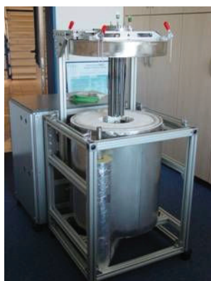
Fig. 3: Demonstration unit for the oxygen separation from air