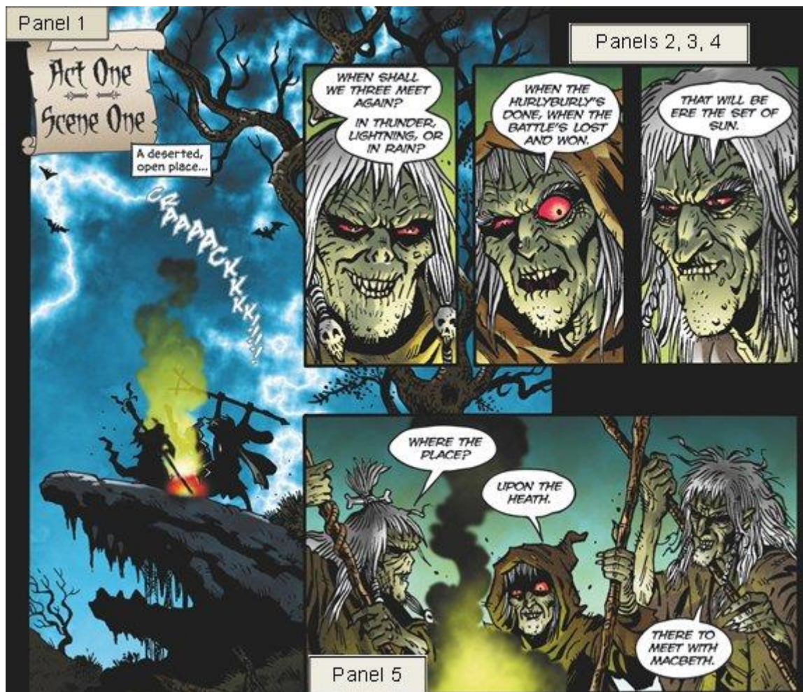
Figure 1: Macbeth panels (Used with permission © Classical Comics Ltd.).

Referring again to the series of Macbeth panels, we see that Panel 1 and 5 are offering information to the viewer. The viewer is asked to observe the scene from a distance, as well as choose their own reading path: the viewer can begin with the text boxes, the background image, or the main image of the witches cooking a spell in a cauldron. Alternatively, Panel 2, 3, and 4 demand attention from the viewer. They are confronted with a talking head image and are asked to focus directly on the words.