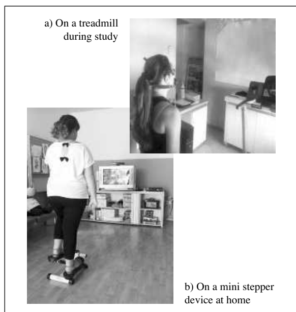
Fig. 3.—Subjects walking with the support of the videogame platform (TW+VG).

owned a videogame console, but it's not so common to own a treadmill. A valid and low cost alternative is to use a mini stepping device or a step bank (Fig. 3). Walking using these devices increases energy expenditure as much as walking at the same intensity on a treadmill 42 .