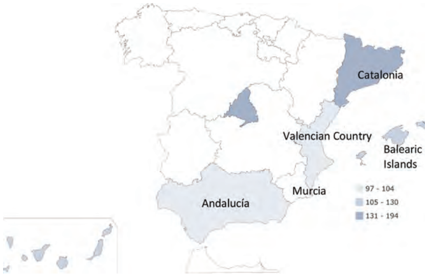
Figure 2: Average daily spending per tourist (euros per tourist per day) for different regions of Spain, 2015.

An important issue to consider is the type of activity that tourists engage in during their stay. For the Valencian region [12], the percentages of Spanish tourists involved in the main activities are: