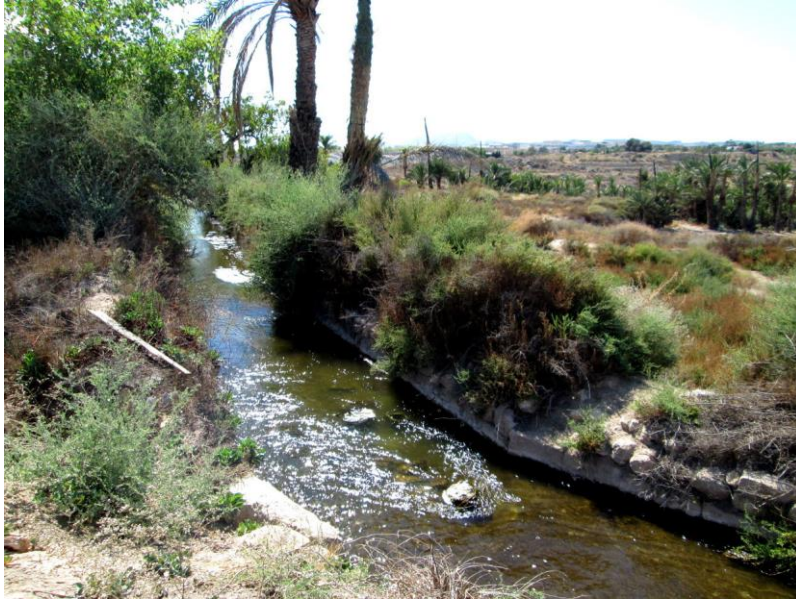
Fig.5: The Sequia Major arriving at its first divider, Albinella . 2013