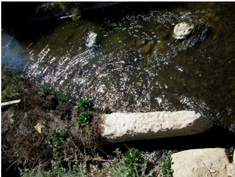
Fig.6: Divider of Albinella . 2013