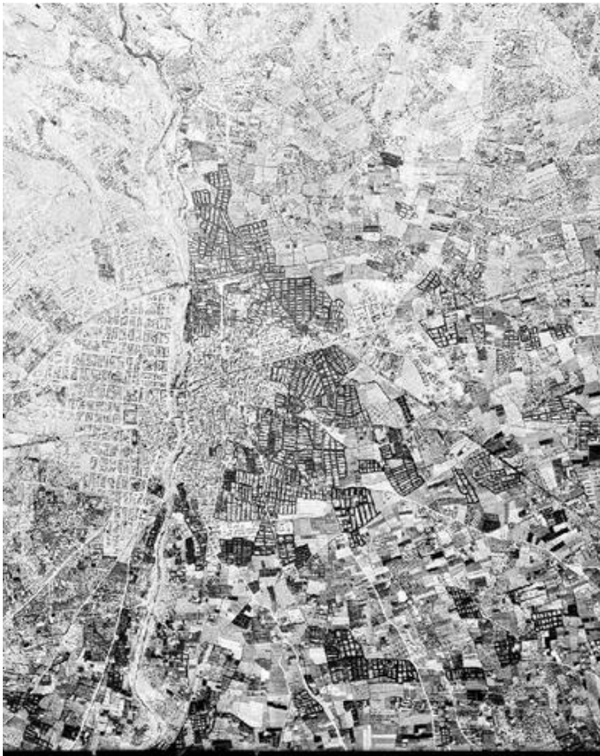
Fig.1. Aerial view of Elche and its irrigation area. Ruiz de Alda, military flight, 1929.