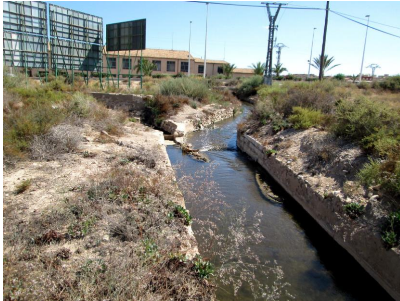
Fig.7: The Séquia Major arriving at the divider of Carrell . 2013

The divider of Aladia-Franch occupies a key position in the whole system, and despite having been traditionally considered a later addition, the truth is that its measures correspond quite accurately to the rassasi cubit of 53 cm. The water distributed by Aladia-Franch belonged to the Infante Don Manuel, separately administered, as shown by the existence of another “book of waters” known as the “ Llibre Xic ” (De Hidalgo, 1851).