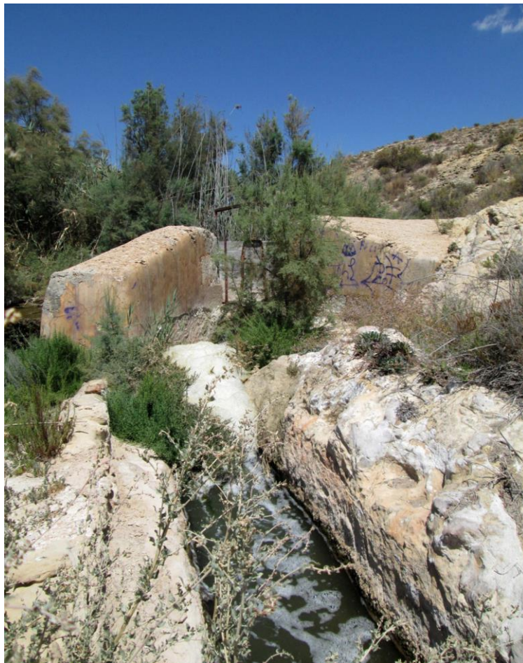
Fig.4: Intake structure ( azud ) and first section (dug out of the rock), Séquia Major . Photograph by D. Aviñó. 2013

rassasi cubits could be considered to belong to the original design. They would be the dividers of Albinella, Carrell, Nafis, Cuñera, Aladia-Franch, Palombar and Carmadet. There is also a proportionality between the sluice gate and the bottom slab of these dividers that leads us to believe that they were built at the same time – Albinella \frac{1}{2} cubit for the sluice gate and 4 cubits for the bottom slab; Carrell \frac{3}{4} cubit for the sluice gate and 4 cubits for the bottom slab; Nafis 1 cubit for the sluice gate and 4 cubits for the bottom slab; Cuñera 1 cubit for the sluice gate and 3 cubit for the bottom slab; and Palombar and Carmadet \frac{3}{4} for the sluice gate and 2 cubits for the bottom slab.