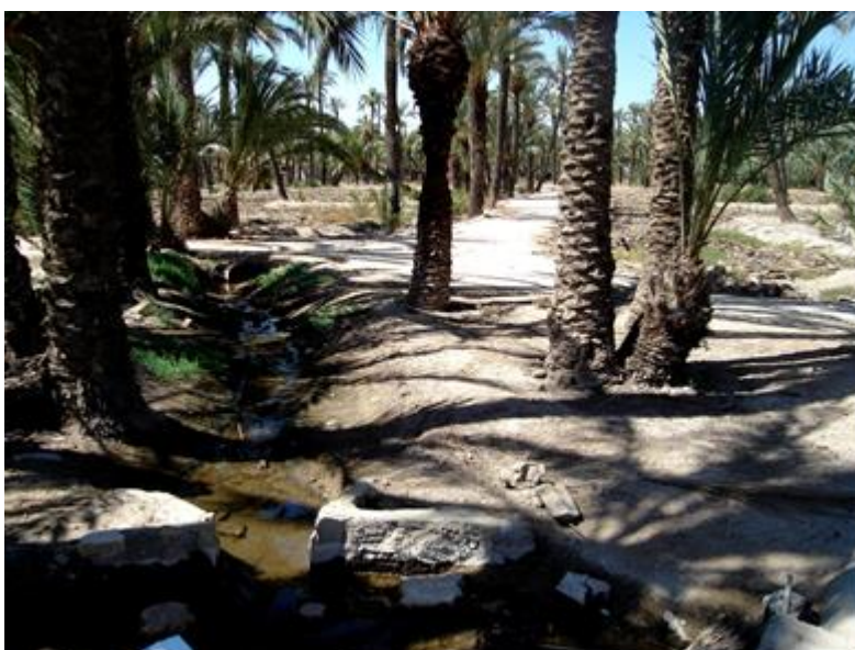
Fig.2. Orchard, Historical Palmeral, Elche. 2007