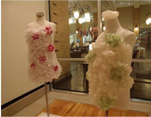
Fig. 1. A mother's dress (left) and a child's dress (right) of inTouch