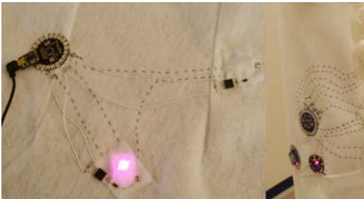
Fig. 3. Soft circuit of inTouch

The inTouch garment is constructed from iterative explorations of soft circuits using conductive fabric, yarn and thread as well as Lilypad Arduino boards with a capacitive sensing circuit and a heat control circuit. The aesthetic and material properties are shaped equally by the needs of the electronic elements, material characteristics of the textiles and qualities of the wearer’s physical movement. Placement and organization of the sensors is guided by body ergonomics, somatic expertise in