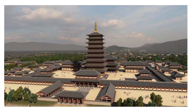
Figure 2: Virtual Hwangnyongsa Temple.

(Real objects & Object with Intentionality) in the Phenomenological heritage classified table. example, we may investigate whether the virtual Hwangnyongsa temple has effects on other cultural heritage in various categories such as Object with Intentionality or Unrecognized object compared with other types of media. Besides, the research on the motivation to transform the two types of Positive selfidentity may be studied. For example, we may investigate whether people want to see the real object, the physically rebuilt Hwangnyongsa temple, or are just satisfied with the virtual model of the temple (Fig.2). These are all interesting research topics that could be investigated based on the Phenomenological classified table.