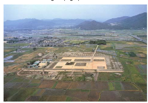
Figure 1: Hwangnyongsa Temple Site.

Among the candidates that belong to "Object with Intentionality" in table 1, let us take the gigantic temple of Hwangnyongsa for example, which was built in A.D. 569 (or 645) and destroyed by Genghis Khan's Mongolian invasion in 1238. Hwangnyongsa temple is one of the most well known lost built heritages in Korea, which could be the symbol of ancient Korean culture not just in architecture but also in early Buddhism representing ancient Korean religion (Fig.1).