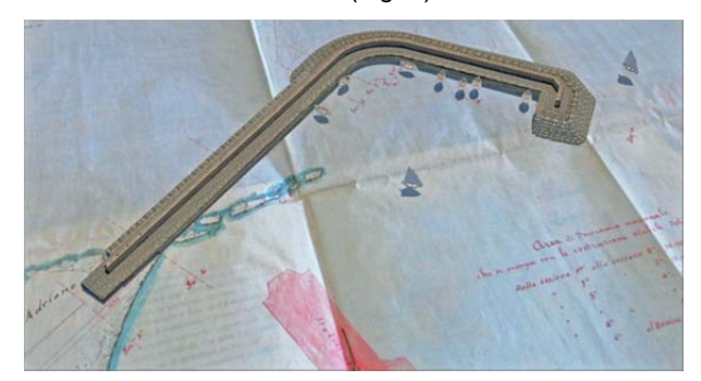
Figure 5: 3d model of the modern L-shaped breakwater; a project plan (1901) provides a ground to the virtual object.

The 3D model intended both to reconstruct in elevation the missing parts of the L-shaped breackwater and to rediscover digitally the massive underwater foundations well visible in shallow water (Fig. 5).