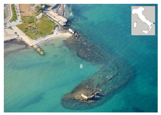
Figure 1: General aerial view of the ancient harbour at St. Cataldo. A: the roman pier; B: the new breackwater.

and the ancient construction material partially re-used in a twentieth-century breakwater that was directly founded on the earlier structure, and is still preserved in shallow water (Fig. 1).