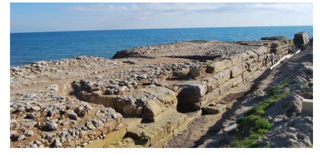
Figure 3: Current conditions of the roman pier.

A two-years long archaeological excavation allowed to dig up the roman pier, that can be actually observed along the beach. The monument shows a compact structure and consists of two outer walls~15 m distant from each other (Fig. 3). The two curtains are made by large squared limestone blocks and filled with hydraulic concrete made with a strong mortar mixed with a local stone aggregate.