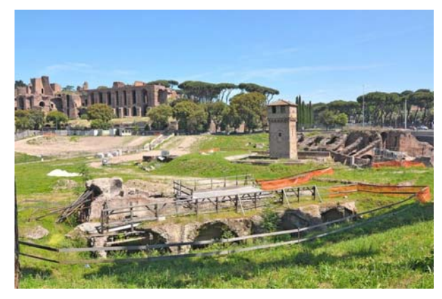
Figure 2: The Circus Maximus in Rome as visible today.

Various transformations and destructions have made difficult the understanding of the heritage site itself. The whole area is currently undergoing restoration and reopening to the public with the project "Environmental regeneration and enhancement of the archaeological remains of the Circus Maximus and the related public spaces in Via dei Cerchi and Piazza di Porta Capena" which included archaeological surveys and small surveys in the still visible remains of the Circus Maximus (Fig. 2).