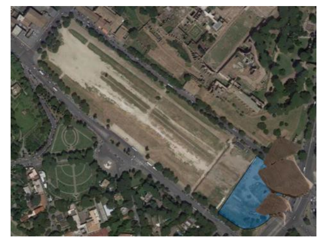
Figure 1: The Circus Maximus in Rome: whit blue indicates the actual archaeological area, with the overlap of the marble tables of the FUR.

The plan of the circus in the first century B.C. was probably less complicated than the construction of the Imperial period (Bigot 1908).