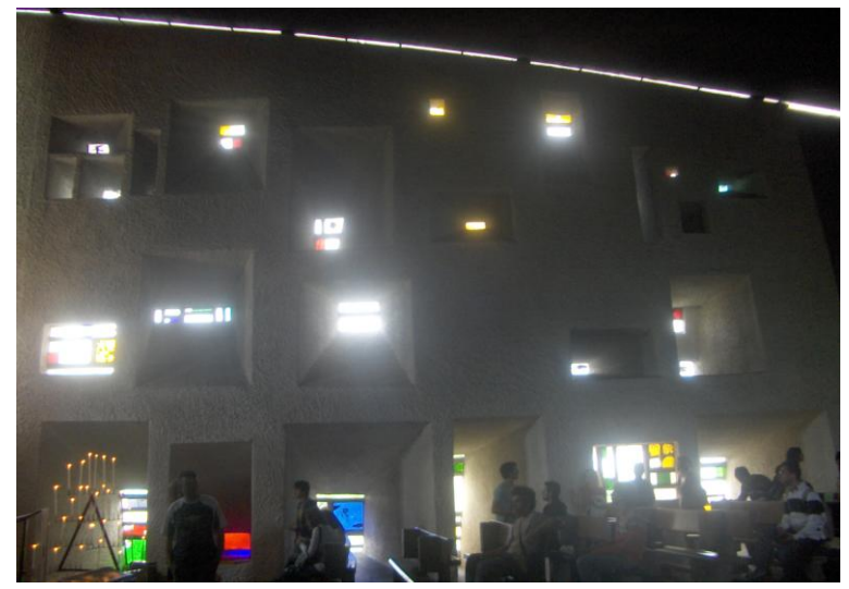
2. Ronchamp Interior View.

As Curtis referred, this phase of Le Corbusier works seems to be the search for perennial and unchanging values, this is his primary motivation and let behind his quest for modernity<sup>5</sup>, that characterized all the work he made before. The Chapel of Ronchamp transcends the normal bounds of architecture with their profusion of spirituality and symbolic content, because it is above all sculptural and figurative creation. Lots of metaphors can be identified: the roof as a boat or a mushroom, the light towers as two people hugging each other or as a periscope. The chapel was conceived as a cave where Le Corbusier has used the light and many processes to create different auras as the main process. There are different windows with several colours that perforated a thick and curved wall, a reference to the Gothic Cathedral the symbol of devotion. The penumbra, that characterizes the space, contrast with the light that came from the layer above the roof, creating a filtered sunlight that passes through the glass. As Le Corbusier wrote "is the apotheosis of plastic emotion".