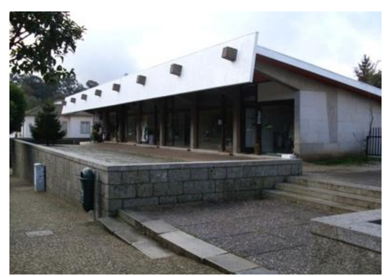
9. Entrance to the Market at Vila da Feira, Portugal. Fernando Távora.

The Market (1953-1959) is located in Vila da Feira and it is the expression for a new solution for the public facilities, as a new Market open to everyone, comparable as a Greek Ágora. The market is the result of an intellectual process about the integration of universal and local values<sup>12</sup>, to prove the possibility to synthetize opposites, creating the Third Way (3<sup>rd</sup> Way), that is a Manifesto of articulation between local and global values and influences. Jean-Louis Cohen<sup>13</sup> named this critical thinking as the "Critical Internationalism" in which rather than reacting defensively to the threat of a homogenizing modernization, the architects made a cautious and calculated decision.