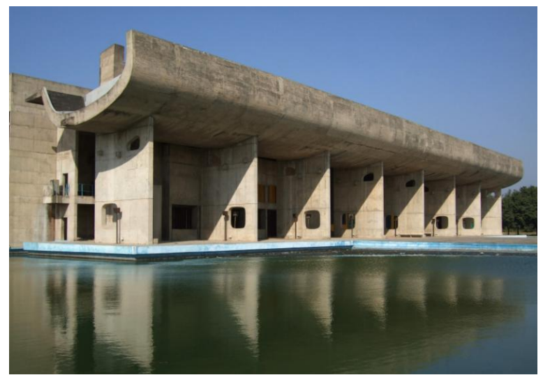
5. Palace of Assembly, Chandigarh. India, 1955. © FLC/ADAGP

Chandigarh can be understood as the culmination of the symbolic creation, where Le Corbusier cast an inventory of primordial symbols such as sun, moon, lightening into the monuments but also his philosophical language from the Le Modulor, the harmonic spiral, the solar cycle and the "Open Hand".