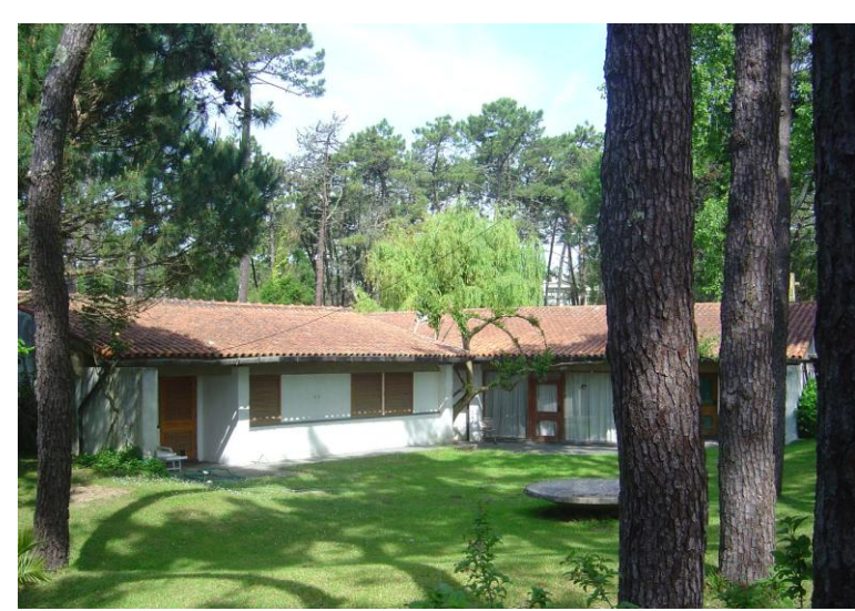
8. View of Ofir Summer House - a house among the trees.

7. Summer House in Ofir. Portugal. Arch. Fernando Távora. View of the house entrance area: the path, the bench, and a little window that brings light into the house interior. It is important to highlight the presence of the yellow colour in the chimney, the only colour used in the house.