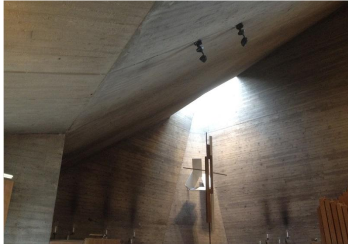
1. Interior of Västerort Church in Vällingby designed by Carl Nyrén and Bertil Engstrand, 1956.

Many forms proposed by Le Corbusier were adopted in Sweden and adapted to the emerging needs of a society that increasingly demanded equality at all levels, as reflected in the Social Democratic government that came into power in 1932, and embraced environmental design as a means to achieve higher living standards. Current socially inclusive designs may find a resource in these Swedish experiments.