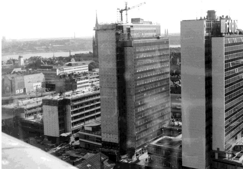
7. Sven Markelius' urban plan of Stockholm devised the demolition of the pre-existing blocks to build high-rise towers. Hötorgscity and Sergels Torg, 1952-1956.