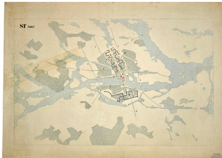
5. Le Corbusier’s urban plan of Stockholm for the Nedre Norrmalm competition of 1933.

proposals should aim to give “a clear and logical expression to the role of the district as a commercial centre,” encouraging the opening of Gustav Adolf Torg Square northwards. 29