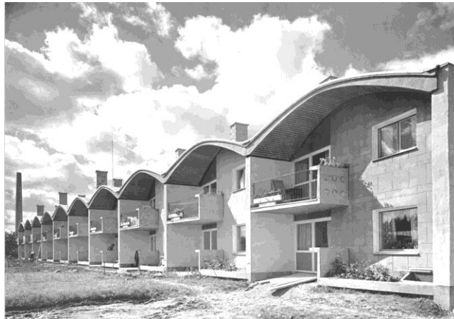
10. Ralph Erskine, row-houses in Gyttorp, 1945-55.