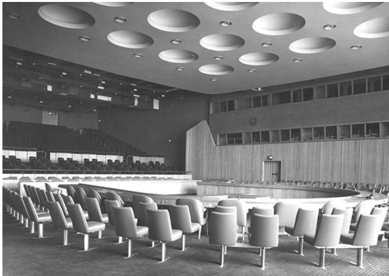
6. Sven Markelius' meeting room for United Nations, 1947-52.