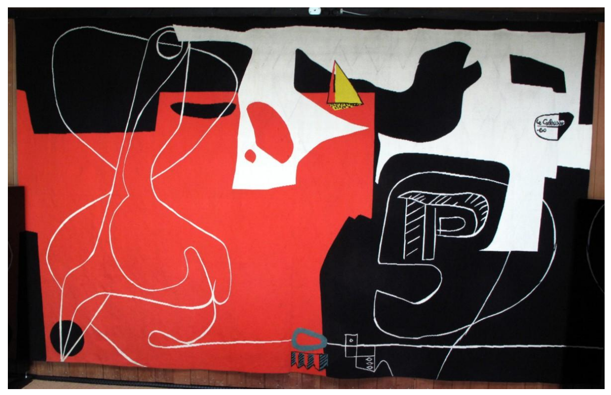
2. Le Corbusier, Les Dés Sont Jetés (The Dice Are Cast), 1960 ©FLC-ADAGP

The tapestry, which arrived in Denmark in 1960, contains figurative elements drawn from materials sent to Le Corbusier by Utzon – a copy of his original competition drawings for the Opera House as well as and the 1958 Design Report known as 'The Red Book', which contained developed sketch plans and photographs of preliminary models. The elements Le Corbusier incorporated into the tapestry's composition include a tracing of one of Utzon's models for the famous shells and an outline of the original site plan that included the footprint of the tram depot with its distinctive round-ended plan form, which previously occupied the site. The elements are gathered together with other figures using a collage technique that brings a diversity of elements into relation with one another while obscuring their particular origin in much the same way the architect drew on images of objects – stones and driftwood – converting them into material for his abstract compositions in painting.