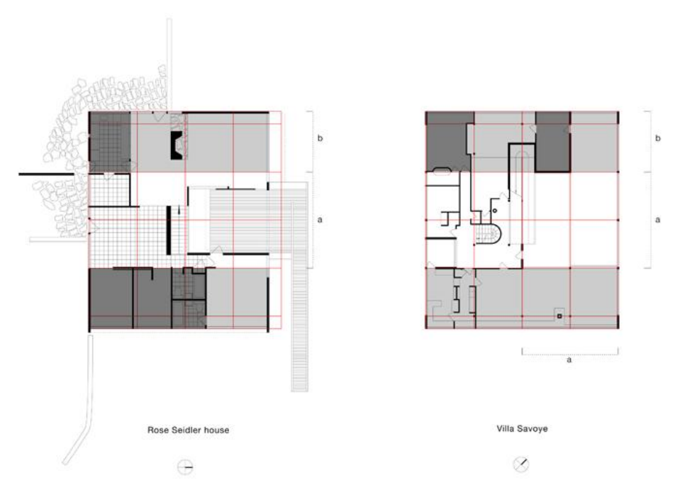
1. Proportional comparison of Villa Savoye and Rose Seidler House plans.

In two projects designed in 1957 Seidler brings a similar analytical method to his appropriation of works by Le Corbusier, specifically from the Oeuvre Complète 1946-1952 . For the House in Clifton Gardens (1957) Seidler draws directly upon the form, massing and proportions of Le Corbusier's housing at La Sainte-Baume project (1948) with its distinctive shallow vaulted profile.<sup>6</sup> At a larger scale but seemly as directly, Seidler draws upon the urban organisation, massing and proportions of Le Corbusier's mid-rise slab blocks for the concourse of Strasbourg project (1951) for his McMahon's Point Development Scheme at North Sydney (1957).<sup>7</sup>