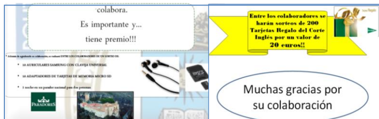
Fig. 2. Incentives used for maintaining respondents.