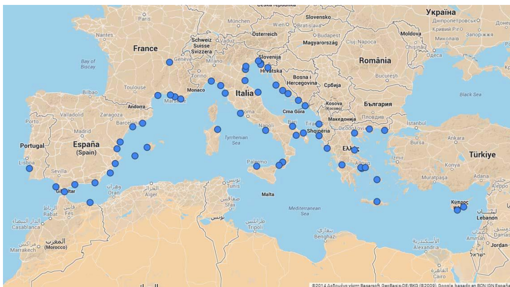
Fig 1. Map with ports analysed

With this idea in mind, a comprehensive list of current practices that could be labeled as good or best practices in 60 ports from 9 countries from the Mediterranean were identified. The goal of this paper being to divulgate the findings made, digest the practices and look for an hypothetical connection between their implantation and the current performance of ports with the aim to identify the best practices that are necessary in any ‘ideal port’. To do so the paper proposes a set of key performance indicators (KPIs) and links the values obtained with the level of ‘good-practicing’ of each port by using a DEA (Data Envelopment Analysis) model.