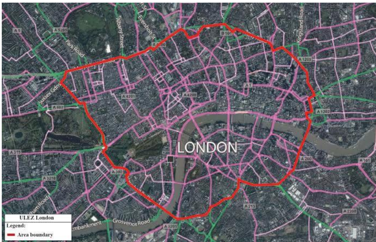
Fig. 2 – Ultra Low Emission Zone in London

Ultra Low Emission Zone (ULEZ) is an innovative proposal for London, expected to be realized by 2020. It is conceived as an implementation of the Congestion Charging Zone (CCZ), a measure currently operative, which started in 2003 to solve traffic congestion and air pollution issues in central London (Beevers and Carslaw, 2004; Weinmann, 2014). CCZ covers a surface of 33 km 2 and an estimated inner population of 200,000 inhabitants. Nowadays, the applied daily charge in CCZ is £11.50 (£10 for all registered vehicles), with a penalty of £130 (reduced to £65 if paid within 14 days) for all vehicles detected while driving into the charging zone without permission (Transport for London, 2014b). This configuration led to a 16% reduction of CO 2 emissions, compared to the previous layout (C40CITIES, 2011), which is considered a value not satisfactory for the high standards of the city. Indeed, according to the Mayor’s Transport Strategy (MTS, 2014), in 2010 road transport was responsible for 21% of CO 2 emissions of central London (Dix, 2013). Despite the introduction of the CCZ, this percentage is expected to increase to 26% by 2020, if integrative robust measures are not introduced. With such premises, ULEZ has been proposed as a valid solution (figure 2).