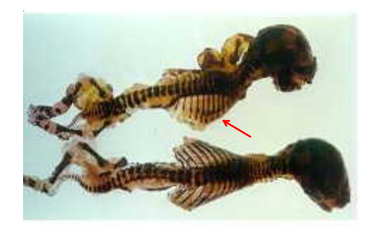
Figure 2: Rabbit fetal skeleton (control); welldeveloped ribs and caudal vertebrae. Fetal skeleton on downside (OA 0.100 mg/kg); note wavy ribs and incomplete ossification of skull bones (arrows).