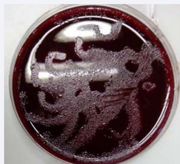
Figure 1 Bacterial growth on Dent selective agar plates inoculated with feces.

As shown with the inoculated samples, some H. pylori presumptive colonies from patient fecal samples were only observed on the plates cultured by membrane technique in 2 out of 4 patients. Colonies could not be purified because of growth of unspecific microbiota on the selective plates. Thus, identification of H. pylori cells within the cultures was only possible by molecular methods such as qPCR and FISH. The low efficiency on H. pylori detection by culture could be due not only to the lack of specificity of culture media but also, the environmental stress on the pathogen through the gastro intestinal tract, which become H. pylori to VBNC state, diminish the pathogen recovery [11]. Other