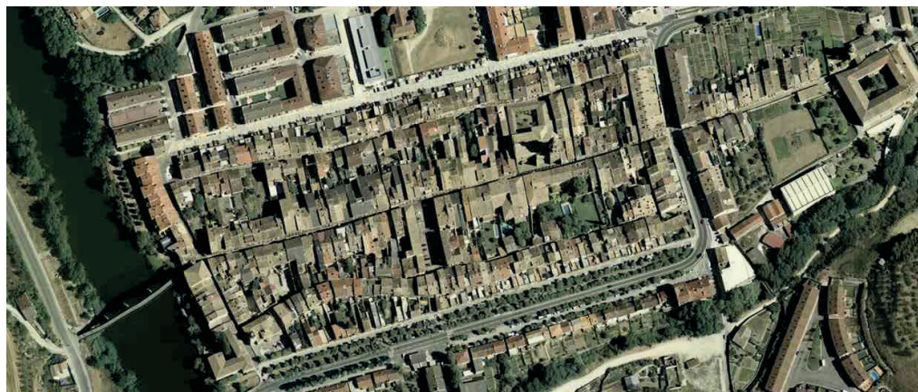
Fig. 2 – Orthophoto of BIC historic center of Puente La Reina.

To properly assess the criteria described, it is appropriate to reflect on an essential consideration. Roofs are an integral part of cataloged buildings, contributing to their external appearance and architectural value. Sloped ceramic tile roofs are the traditional roofing solution in many old town centers in Navarra, particularly in most cataloged buildings in municipal urban planning regulations.