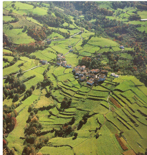
Fig. 1 – Ziga, a representative village in the Baztán Valley (Navarra from the sky. Santander Bank. 1997).

Some significant examples in Navarra that could be affected include towns such as Ziga in the Baztán Valley (Fig. 1), where traditional architecture maintains unique construction constants and integrates harmoniously into the natural landscape, or Ujué, with its cluster of buildings adapted to the topography of the hill crowned by the fortress church of Santa María. Also worth mentioning are the traditional farmhouses of the Navarrese mountains, whose beauty results from logical construction adapted to the natural environment, along with many other examples.