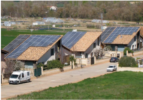
Fig. 3 – Negative visual impact due to the installation of solar panels on a tile roof.