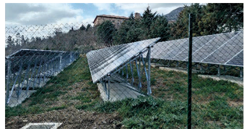
Fig. 6 – Leyre monastery. View of the photovoltaic installation located in an area of former monastery orchards. In the background, the monastic complex.

buildings. Although the goal of utilizing renewable energy sources in buildings is commendable, certain installations are currently not appropriate for historic buildings and town centers that are part of cultural heritage. It is evident that technological advancements in these installations are on the horizon, and within a few years, new solutions may emerge that better align with the regulatory framework for protecting these buildings. These developments could help reconcile the so-called energy transition with the preservation of the architectural values of buildings that form part of cultural heritage.