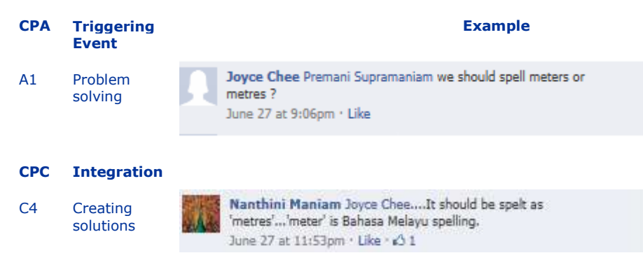
Table 6. Online interaction pattern of cognitive presence for the event "stayed at school".

Table 5. Online interaction pattern of cognitive presence for the event of "meters or metres".