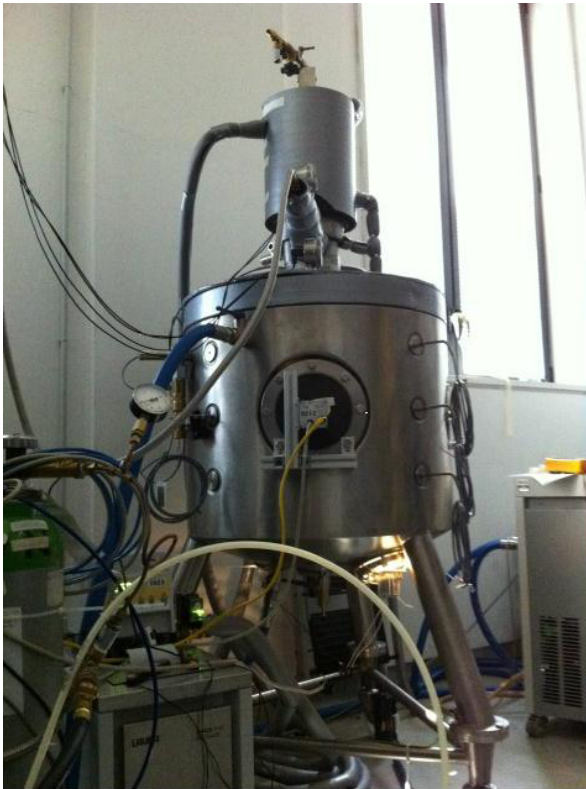
Fig. 1. Diagram and picture of the 40 kg Geyser detector