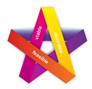
Fig. 1 Three criteria for design outcomes.

With the aim of providing European CIs with an innovative tool that allows them to offer new services and grow in the international market, Design Thinking has been used as a working methodology. The implementation of this methodology has been aimed at understanding and solving the real needs of the CIs, in order to align their needs with a technologically feasible and commercially viable solution, increasing their competitiveness (Fig. 1).