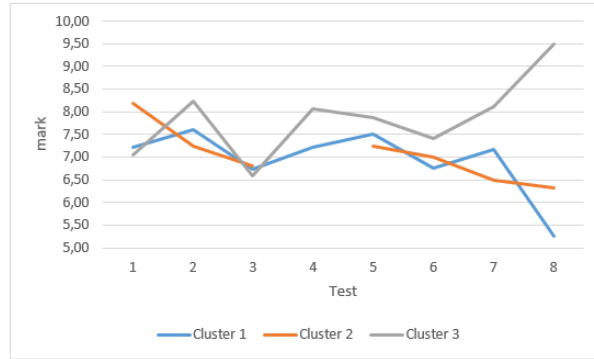
Figure 1. Evolution of the average mark per cluster.

Figure 1 shows that students in Cluster 1 and 2 have followed a decreasing trend in their results of the continuous assessment questionnaires, compared to students in cluster 3 that are characterized by an increasing trend in their results of the questionnaires. The main difference between clusters 1 and 2 is that cluster 2 maintains a nearly constant decreasing trend and cluster 1 has a greater variability in the average test results.