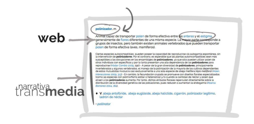
Figure 1. Elements of the terminological article for the term «polinizador».

Information contained in the terminological article for the term «polinizador» is shown in Figure 1.