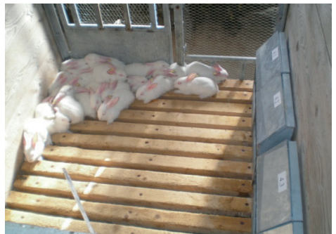
Figure 1: Collective pens with plastic grid (left) and wooden slatted floor (right).