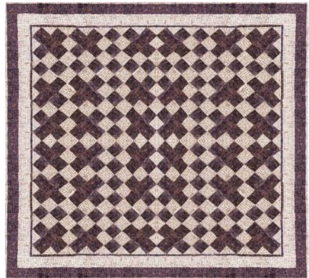
Figure 10: Virtual restoration hypothesis for room E (ca 2 x 2 m).

The poor residual mosaic surface was sampled in order to fill the lacunae and the rebuilt parts were replicated up to recreate the entire mosaic floor (Fig. 10).