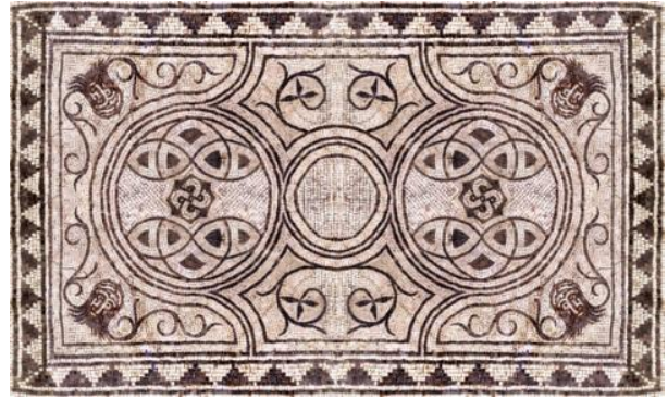
Figure 6: Virtual restoration hypothesis for room B (ca 2.8 x 1.5 m).