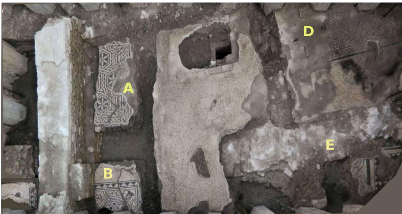
Figure 1: The overall excavation in Piazza Anita Garibaldi, Ravenna; size of the excavation is ca 10 x 6 m. Mosaic of room A is located on the left-top side; room B on the left-bottom side; and rooms D and E on the right-top and right-bottom sides, respectively.