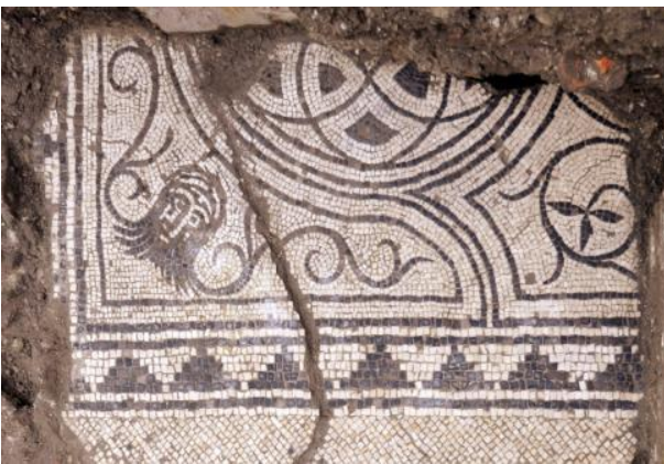
Figure 5: Room B, decorated with the so-called "Neptune" mosaic.