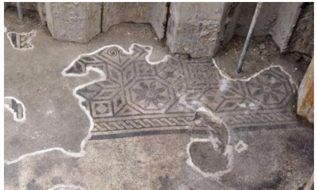
Figure 7: Room D, decorated with an octagon mosaic.