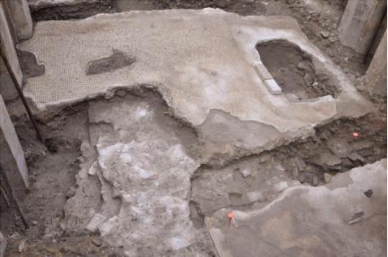
Figure 2: Central room (C) with well and white mosaic.