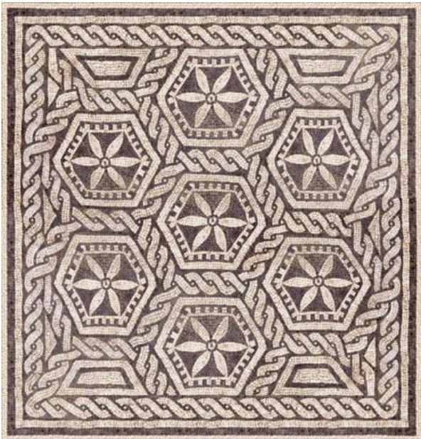
Figure 4: Virtual restoration hypothesis for room A (ca 2 x 2 m).