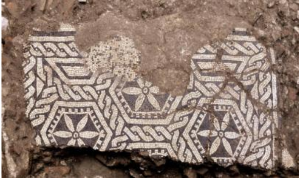
Figure 3: Room A, decorated with a hexagon mosaic.

The same procedure was applied in order to reconstruct the lacking parts of the frame and of the braided motif surrounding the hexagons.