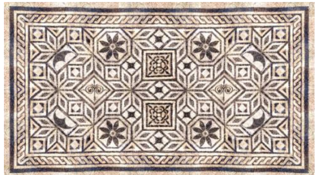
Figure 8: Virtual restoration hypothesis for room D (ca 4 x 2 m).