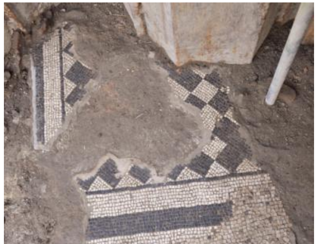
Figure 9: Room E, decorated with a checkerboard mosaic.