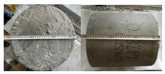
Fig. 2. \phi 30×30cm cylinder