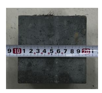
Fig. 1. 10 \times 10 \times 10 cm prism