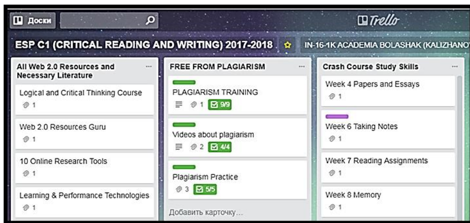
Figure 1. This figure demonstrates one of the classes designed by the teachers

Such Trello Board's features as fragmented information and access to the new content only after the consolidation of the already learned; an optical reflection of students' progress and synthesis of new skills, were expected to strengthen learners' interest and motivation. They should also make learners self-evaluate their abilities for further learning and allocate time to complete assigned tasks (Figuroa, 2015). Hence, Trello Board seemed to be entirely coincided with students' needs and allowed creating various courses in line with the annual curricula (see Figure 1).