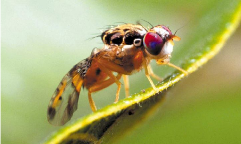
Ceratitis capitata (Wiedemann), courtesy of USDA-ARS