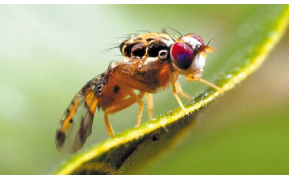
Ceratitis capitata (Wiedemann), courtesy of USDA-ARS)