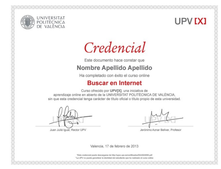
Figure 2. An example of free certificate called "credential".

This Evaluation Cycle demonstrated that a MOOC initiative with several courses could be run smoothly using the modified code from Google Course Builder. Additionally, the cycle highlighted the downside of heavily customising an open source code, as it was impossible to migrate to the newer versions of Google Course Builder without a tremendous effort to port the customised code. The new releases included many improvements (as having several courses in the same application, event recording or aadministration interface) that we were not able to incorporate.