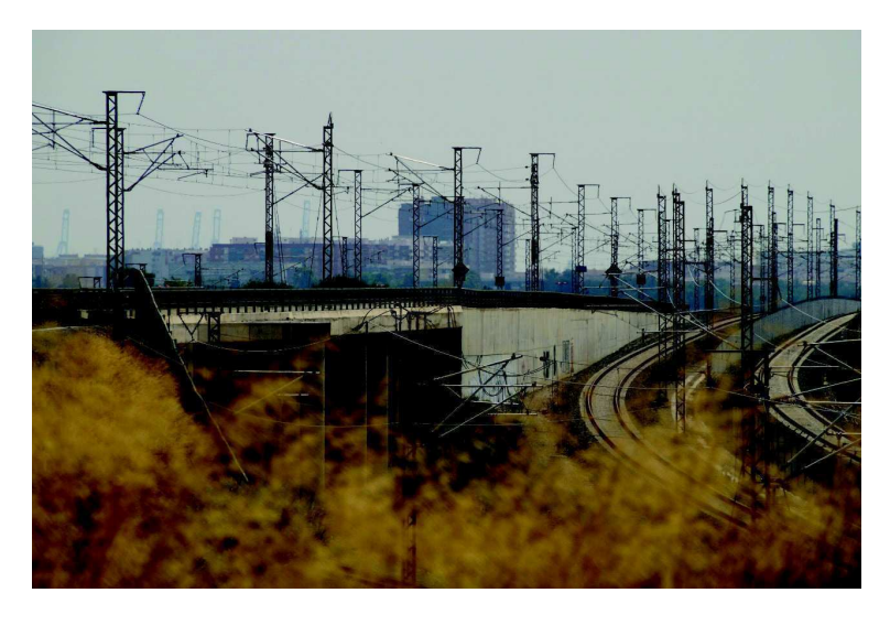
Figure 4. . The 'new' landscapes of High Speed Train infrastructure on metropolitan rural areas of Valencia.