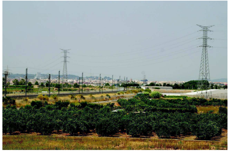
Figure 5. Chaotic mix uses in metropolitan rural area of Valencia.

Figure 4. . The 'new' landscapes of High Speed Train infrastructure on metropolitan rural areas of Valencia.