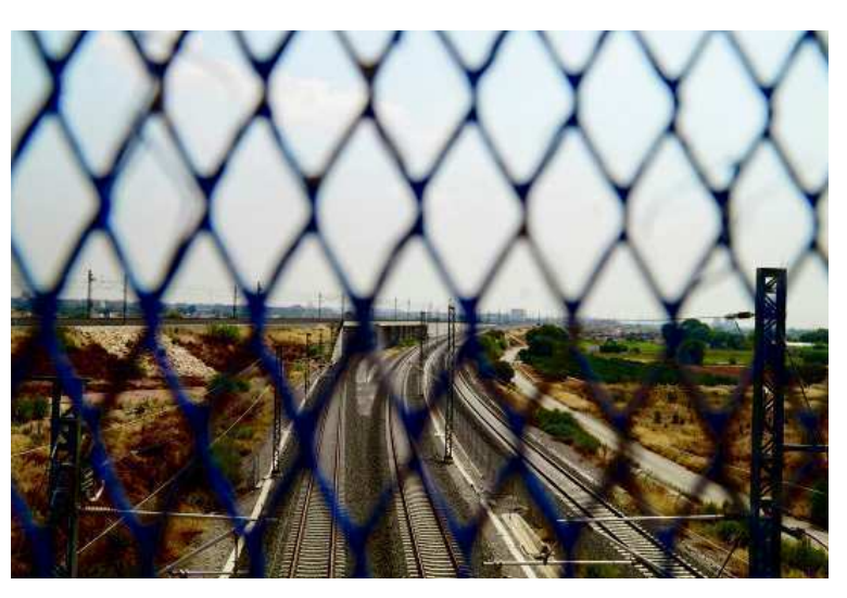
Figure 2. High Speed Train infrastructure seen from the bridge to pass.