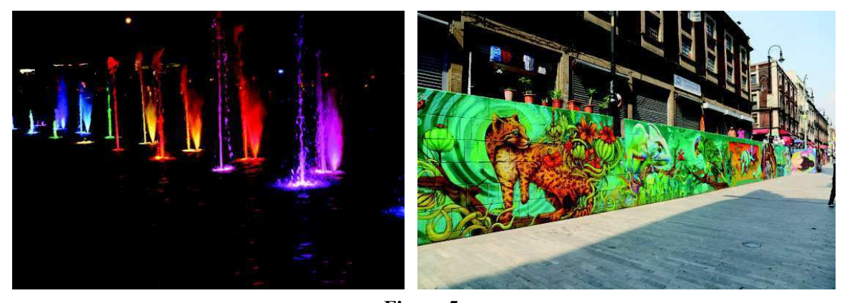
Figure 5. Interventions of the Public Space Authority. a. (left) Walk of the composers - 2nd section Chapultepec. Miguel Hidalgo. b. (right) Historical Center.

Clearly the public space has gained a greater "attention" on the part of the current capital government, since the number of interventions has increased. Nevertheless, an unequal sociospatial distribution can be observed, since the majority of the interventions have been carried out in the delegations Miguel Hidalgo and Cuauhtémoc, in the latter especially in