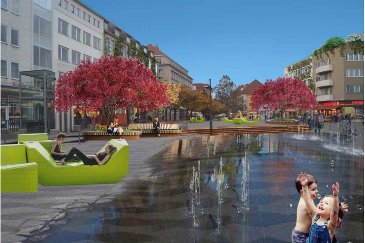
Figure 5. Model of the heart of Spandau.