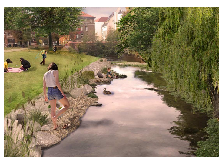
Figure 3. Model of the river "Mühlengraben" (rendering)

supposed to display the possibilities to establish various kinds of green in dense urban spaces with different circumstances and needs. Beside the three levels of greening, which will take place in every area, single solutions matching the respective spaces were developed. The mentioned interventions will be elaborated in the next sections.