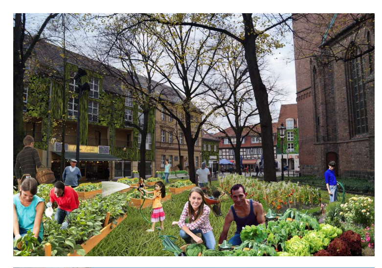
Figure 4. Model of "the Garden of Eden" at Reformationsplatz in the oldtown of Berlin-Spandau.