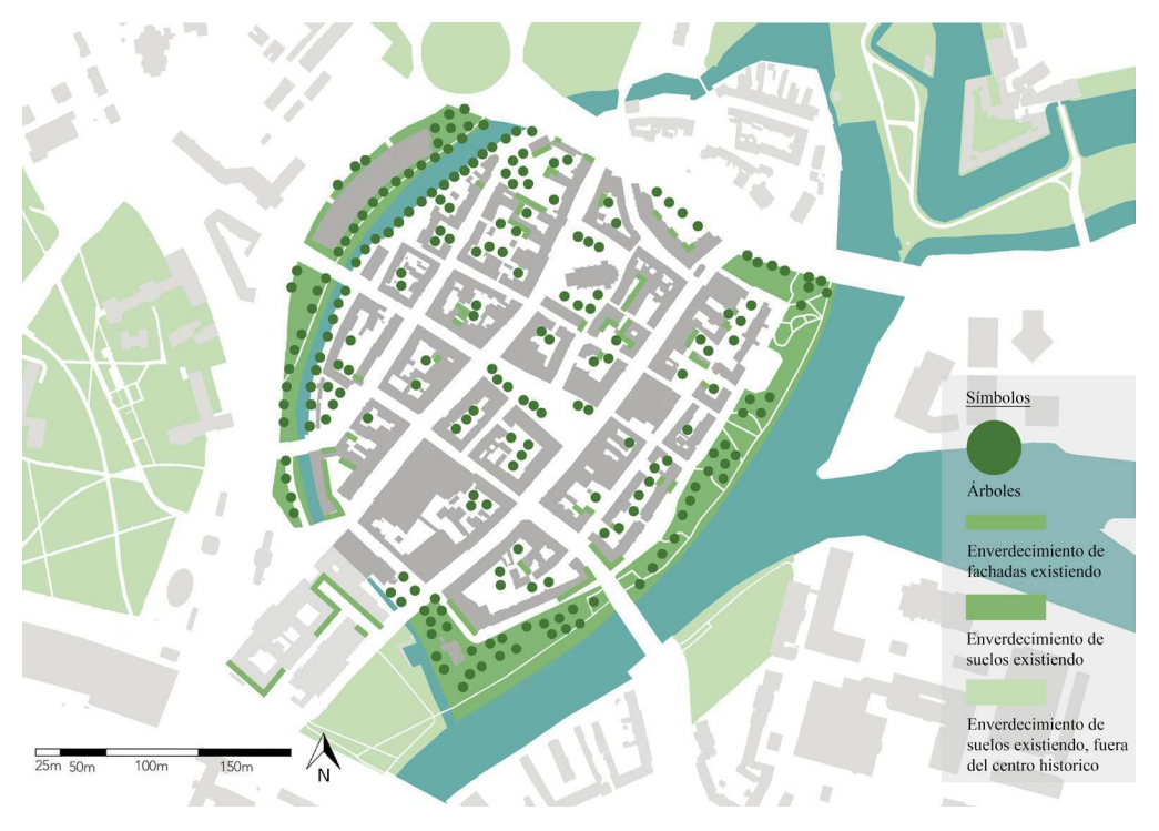
Figure 6. Model of green spaces, green corridors and trees in the oldtown of Berlin-Spandau

The "green corridors" run along the main connecting lines of the old town, as due to the circumstances of tight and sealed spaces, it is hardly possible to plant classical uncovered spaces on the ground. Therefore, the greening along the corridors takes place on three levels: the first level is the horizontal greening of roofs, the second level comprises a vertical greenery of building facades or walls. The third level includes the vertical greening of the ground, often by using flexible planting walls. The aim of the concept is to always implement at least one level of the greenery along the corridors, to create a green connection of the subspaces. For this type of greening, all the places were analyzed to identify potential areas. An exclusion criterion for facade and roof greening in many cases is the historical protection of of houses and buildings, a challenge that had to be dealt with. The basis for the green areas was set by the creation of a plant catalogue, which lists native trees, shrubs, climbing plants and herb plants which are to