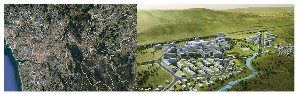
Figure 5. PlanIT Valley, Paredes, Porto, Portugal.

Urban development is proposed in order to deviate from the current path that positions the concept of an intelligent city solely as an application of new technologies in urban environments, in order to emphasize the idea that the development of solidarity and harmony of our contemporary cities should be based on the care and maintenance in the design of the relationship between the traditional structures of a city and the new information infrastructure, always taking care of the implications of the changes that have on the daily life of the citizens, and with the capacity to face the notions of sustainability and transition projects that include changes in the governing behaviours, the power, economic accessibility, participation and inclusion Social; a new model for social justice and human prosperity against elite interests and the suppression of values.