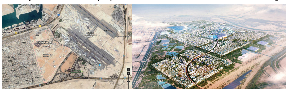
Figure 4. Masdar City, Abu Dhabi. Sources: Google and Blogsmartcities (WordPress) (https://blogsmartcities.wordpress.com/2014/04/30/masdar-city-die-okostadt-in-derwuste/)

Over time and above all due to the great technological advances that are available to us, an endless number of models have emerged