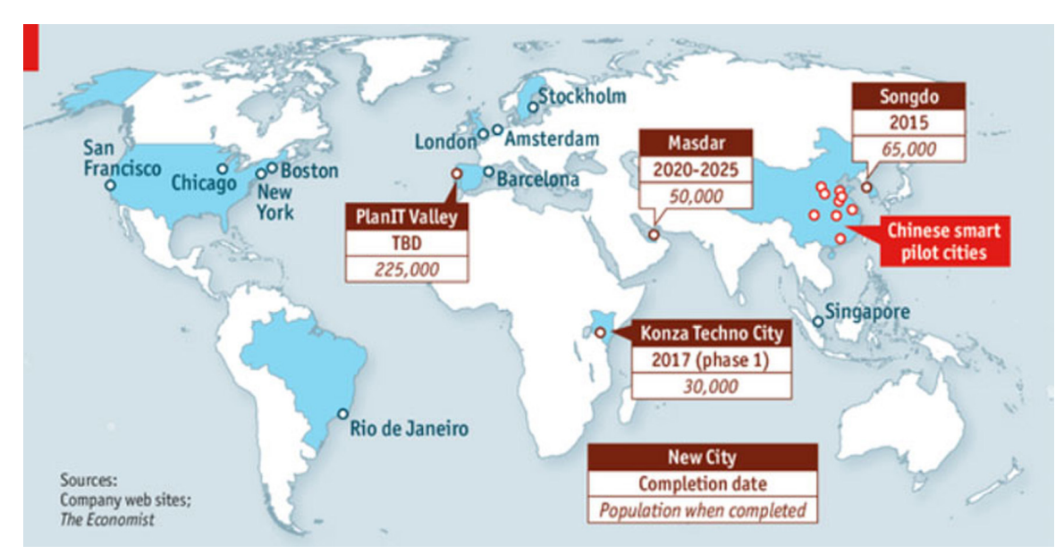
Figure 2. Location of prototype cities in the areas of East, South Africa, and Europe.

The main cities of this type to be highlighted can be located in the areas of East, South Africa, and Europe, which started to project from the year 2000 (Figure 2).