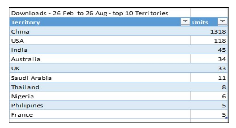
Figure 3. Downloads of The IELTS Score Predictor.