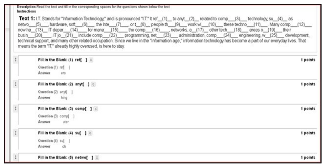
Figure 1: C-Test build in Blackboard.

In 2011, I created an Online C-Test within the Blackboard learning platform when required by my Australian university (James Cook University) to assess the academic language proficiency of a large group (93) of Chinese undergraduate I.T. students studying at a Beijing university on a course provided by my university and in English medium. Through an external quality audit by the Australian Universities Quality Agency (AUQA), concern had been raised at the level of English demonstrated by some students, and my university wished to assess English language levels. Although students were required to have reached an IELTS overall 5 score, or its equivalent, to enter the course, concern had been raised that a large proportion of the 1st year cohort were not functioning acceptably in the learning and teaching medium of English. I was required to design and provide an English language competency test that could be administered efficiently, and did so using a C-Test construct in Blackboard, with four texts sourced from the 1st year IT syllabus.