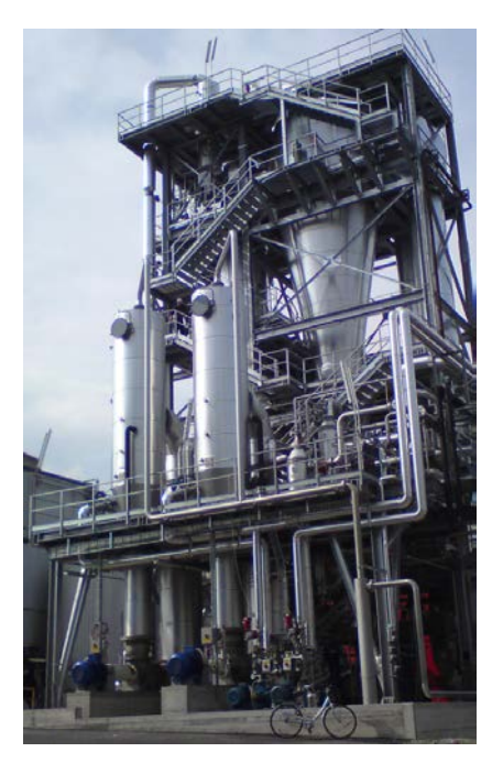
Fig. 3: Picture of PSSD commercial plant