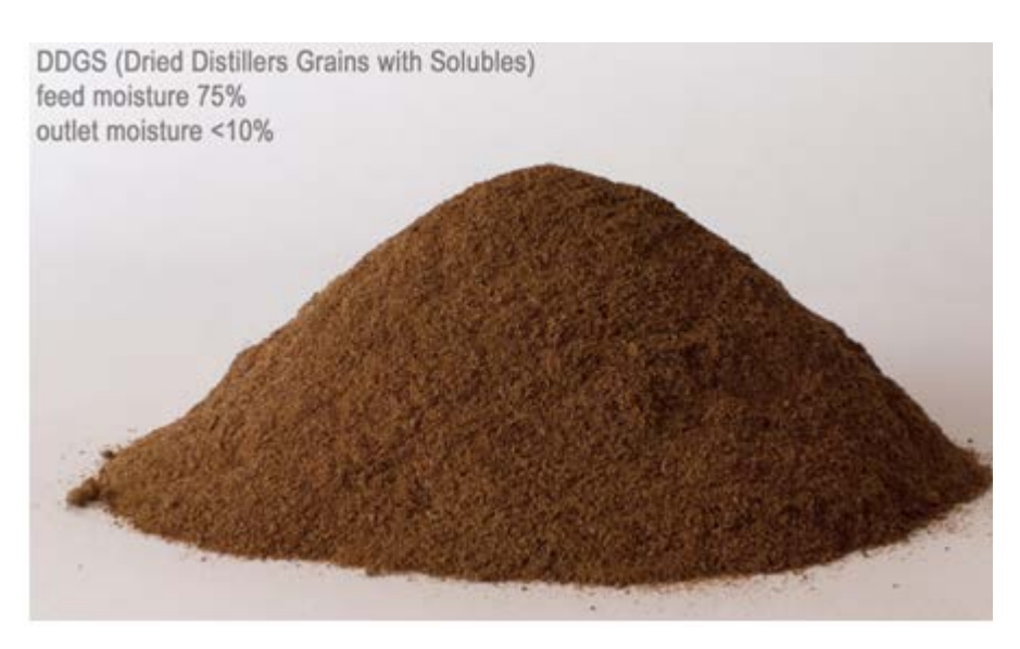
Fig. 4: Picture of DDGS produced from PSSD process