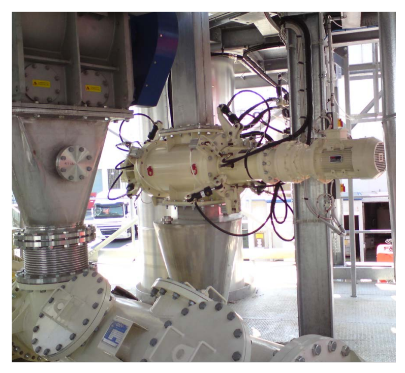
Fig. 5: Picture of novel and innovative back-mixing system as part of PSSD process