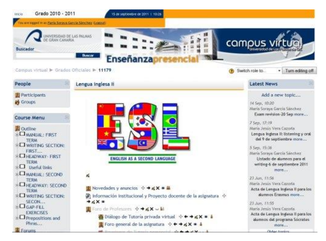
Figure 3. Sample page from the Virtual Campus.

The presentations were all designed following the same structure: introduction, explanation and conclusion. On some occasions, lecturers would elicit questions to their virtual students to confirm that the content was understood. A few minutes would then elapse for them to answer their virtual teacher's questions. The target content was always briefly introduced in the warm-up introduction with a short talk and one or two questions addressed to students relating to their prior knowledge about the topic. After the explanation, the conclusion followed. This last part connected with the warm-up section and with what students should have learnt after listening to the explanation. The language teachers often asked students to continue doing some further reading or extra activities presented on Prometeo.