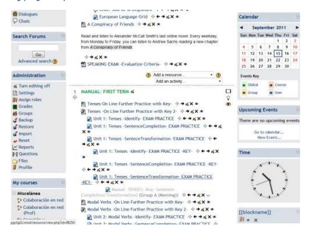
Figure 4. Activities on Virtual Campus with Keys for class reinforcement and independent learning.

Further practice was offered in a number of additional activities either on the VLE or on Prometeo. Exercises with an answer key were also published on the Virtual Campus to reinforce class content especially in terms of grammar and writing. Moreover, interactive activities were created using Prometeo to consolidate the content delivered both in class and on the VLE. Most of these activities allowed students to check their learning progress by means of the self-evaluation tasks.