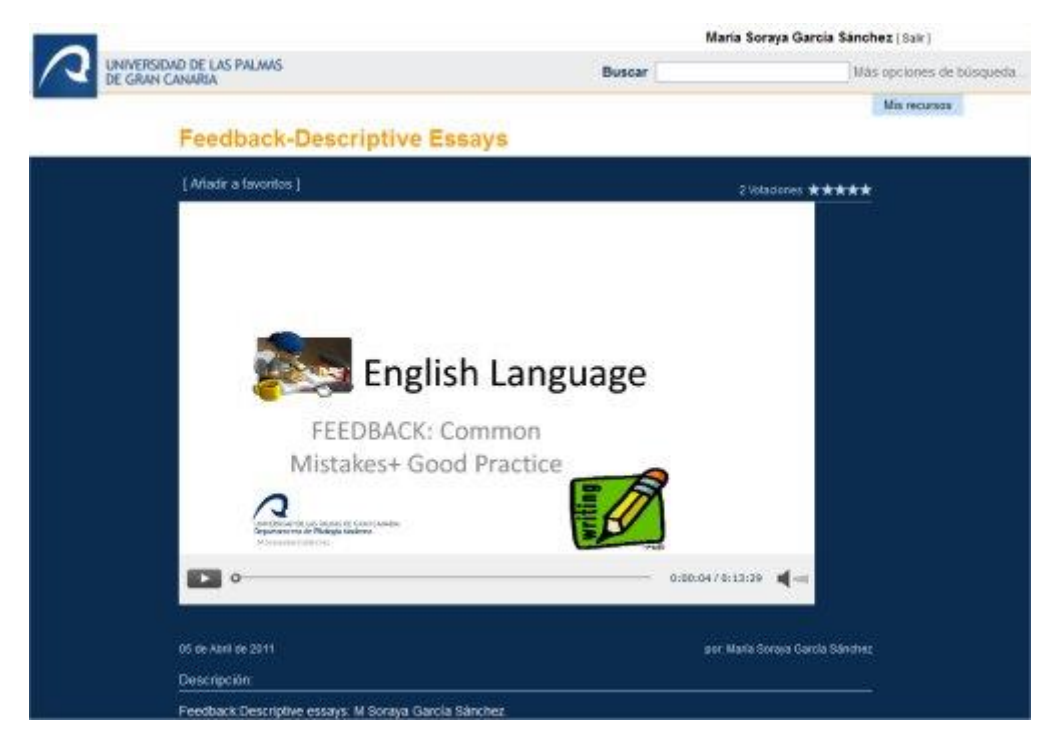
Figure 1. A sample Picasst class. Providing General Feedback on Good Practice and Common Mistakes when writing a Descriptive Essay.

Picasst is software that can be used by any teacher at ULPGC. It only requires access to a computer and a microphone. At present Picasst Beta is open to the public by registering on <a href="http://picasst.com">http://picasst.com</a>. The site comprises a powerful and versatile tool that allows one to record their classes, explanations or presentations on-line, with great ease and speed. Once finished, students can access this content instantly. With Picasst teachers can record their classes using any digital means (smartboard, a word document, a picture or a PowerPoint presentation and publish it on the platform, or even embed it onto their personal websites or Moodle platforms. Teachers can decide if everyone can view their classes or just their registered students. Students, on the other hand, can instantly watch and listen to the class as many times as they wish. They may also pose open questions to their lecturers or open a discussion with fellow students.