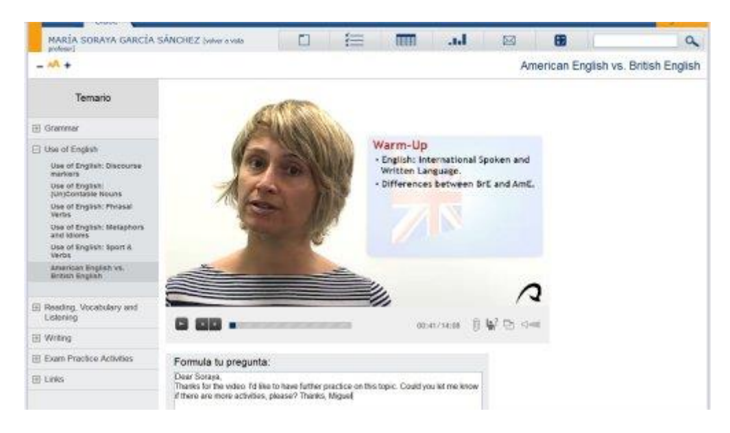
Figure 2. A video sampling differences between British and American English and students' participation by posting a question in Prometeo.

The presentations were all designed following the same structure: introduction, explanation and conclusion. On some occasions, lecturers would elicit questions to their virtual students to confirm that the content was understood. A few minutes would then elapse for them to answer their virtual teacher's questions. The target content was always briefly introduced in the warm-up introduction with a short talk and one or two questions addressed to students relating to their prior knowledge about the topic. After the explanation, the conclusion followed. This last part connected with the warm-up section and with what students should have learnt after listening to the explanation. The language teachers often asked students to continue doing some further reading or extra activities presented on Prometeo.