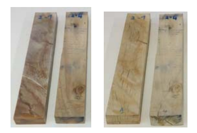
Fig.6: Effect of continuous microwave drying of wood at 500 W; Before and after drying.

In addition, the darkening is located in the center of the plate illustrating the intense internal volumetric heating in the case of microwave heat treatment [11]. In the case of of continous drying process under 500 Watts of microwave power, these defects are observed at the end of drying (Fig.6).