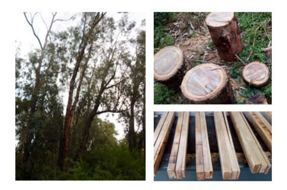
Fig.1 Eucalyptus tree (Gomphocephala): region of Oued Ksab, Tunis, Tunisia.

Eucalyptus trees are characterized by their ecological plasticity and their rapid growth. It covers 18 million ha in 90 countries in the world. Eucalyptus is mainly used in the wood industry and it is also used as an energy source or in building. Previous studies have shown that Eucalyptus wood has a specific sensitivity during final drying as collapse, cracks and warps [9]. The samples of green Eucalyptus wood used in this work were recommended by the INRGREF. The samples are rectangular (30* 5 * 2 cm3) size boards, sawn in the fibers direction (longitudinal direction) and have an initial average moisture content of 52%, (Fig.1). The mass of dry wood was obtained after keeping the samples in a controlled temperature oven at 103°C until a constant mass was reached. These samples are wrapped with cellophane paper and stored in a refrigerator until the date of the experiments to retain their green state properties. The drying conditions achieved are presented in (Table 1).