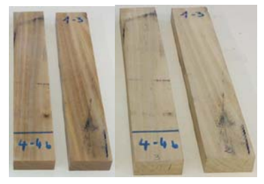
Fig.8: Effect of intermittent microwave drying of wood at 500 W; Before and after drying.

The second solution proposed in this study is to apply an intermittent drying process. This process is only considered at the microwave power level, and the conditions of drying are shown in (Table 1). The qualitative observations are illustrated by the photos of dried wood samples, (Fig.8). It is observed that drying defects related to the level of microwave power in the continuous drying are absent in the intermittent drying. The absence of the various defects can be explained by the cooling of wood sample and mechanical stress relaxation during the intermittency phase.