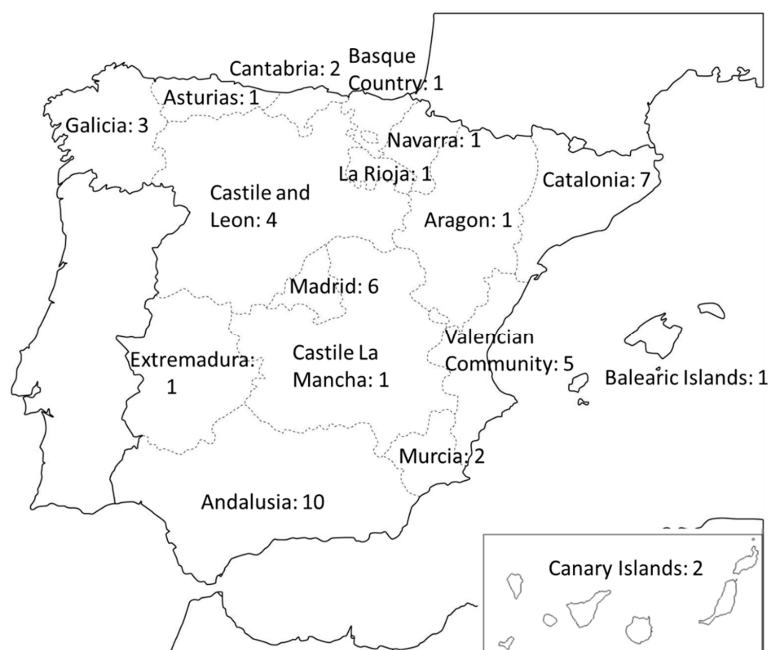
Figure 1. Distribution of Spanish public universities. Source: Authors.

Spanish public universities accounted for 0.9% of GDP in 2013 and 74% of this expenditure corresponded to labor costs [59], so the remaining 26% is related to products, services, and works—and thus justify the importance of studying universities as public procurement bodies.