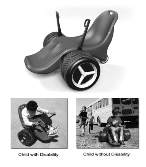
Illustration 4. Play Racer

The resulting design is an authentic Design for All product, firstly identify as a toy, secondly as a therapeutic product, and valued for both children market segments (Tsai Lu Liu, 2007).