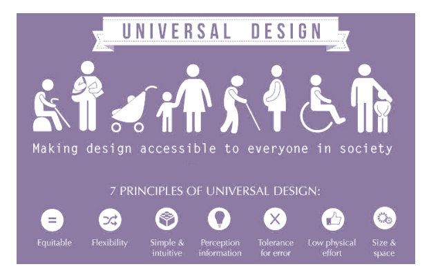
Illustration 1. Universal Design and its principles

It refers to the dimensions of the design. They have to fit all user's body sizes, postures and mobility abilities for its use, manipulation, approach or reach. The key gaols in this principle are: providing a clear line of sight to the design elements from a stood or seated position, enabling different hand and grip sizes, providing enough space for the use of personal assistance devices and ensuring comfortable reach to all components for any standing or seated user.