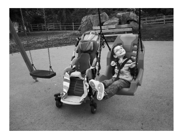
Illustration 5. Accessible swing

Here below, there's another example of a play children product developed by "Let's Play" at the University of Buffalo (New York), using the "From-disable-to-able" methodology. It is an accessible swing for children of different ages. It applies to all Design for all principles and benefit both children with functional diversity or any children who feels unsafe, scared, has back problems or does not like to be push by pushing his/her back.