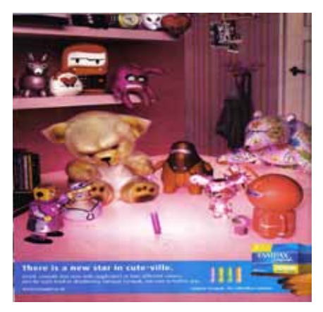
Figure 3. Tampax.

Another example of sanitary products is figure 3, on Tampax. The illustration shows a girl's room in which some toys are surrounding a tampon as if it were a brand new toy. The slogan says: (advert text) "There is a new star in cute-Ville. Small, smooth and now with applications in four different colours, one for each level of absorbency. Tampax Compact, too cute to bother vou".