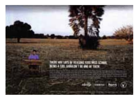
Figure 1. Tampax and Always.

In some regions of the world, many girls have to stay home when they get their period just because they don't have protection. Which means that may fall so far behind, they drop out. You can help change that. Your purchase of Always or Tampax helps us donate $14 million through 2008 to the United Nations Association's HERO campaign to provide feminine protection and education to girls in Southern Africa. Because every girl deserves her chance to shine. Use your period for good at www.beinggirl.com/hero)