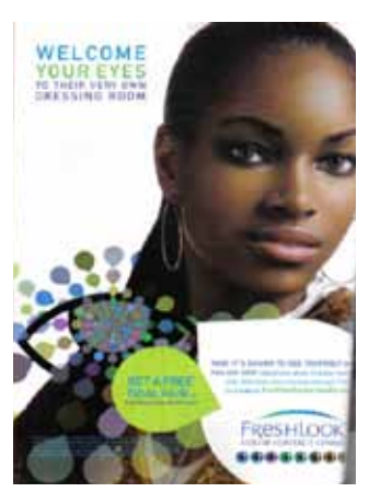
Figure 5. Freshwear

In turn, advert 5 on Freshwear Freshlook color contact lenses (see Figure 5) provides another example of a persuasive technique, which in my view, may create in people in general -and in teenagers in particular- the artificial necessity of achieving something, a different color for their eyes. In this case, the ad creator tries to persuade consumers to buy their products by introducing gift packages or bonus packs to attract them. Get a free trial pair is the sales promotion of this ad. According to Soo Ong, Nin Ho, and Tripp, (1997), "A bonus pack is a manufacturer's sales promotion technique of giving the buyer an extra quantity of a product at the usual price (e.g. an extra 6 oz free; buy four, get one free)". In other words, the buyer feels she or he is getting two products for the price of one. In this advert, we can see the face of a woman with extraordinarily beautiful eyes and many colorful drops framing the headlines and the body of the advert, which says: Get a free trial pair at freshlookcolorstudio.com. Now. It's easier to see yourself in a new eye color. Upload your photo. Find your favorite color. Then share your new look with your friends. Try it today at freshlookcolorstudio.com.