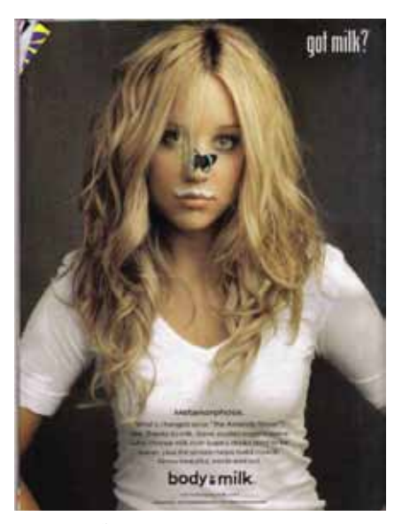
Figure 11. Milk.