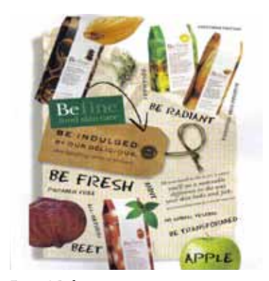
Figure 6. Befine.

This same example can be extrapolated to most products related to body care. Furthermore, Befine uses a foregrounding technique, that is, parallelism by repeating the bare imperative "be" to weaken the possible incredulity and rejection of potential consumers, all this together with a highly attractive visual impact of its images, make this kind of adverts especially dangerous for vulnerable teenagers.