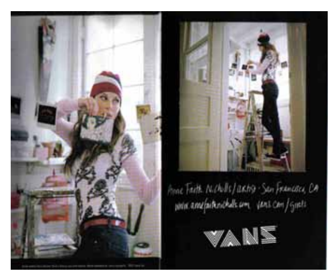
Figure 10. Vans.

consumption of milk as opposed to sugary drinks; however my aim has been to show it as an example of what I could call "positive" manipulation.