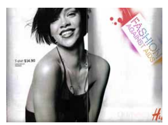
Figure 2. H&M.

Tampax products use social campaigns to reach the heart of young impressionable minds. This is the first kind of manipulative adverts and, at the same time, the worst of them all, because, under the slogan "there are lots of reasons kids miss school, being a girl shouldn't be one of them" Tampax and Always let them know that by buying their products, a percentage of that money will be aimed at that social purpose. It is not the fact of participating in such a campaign which is manipulative as it can be described as a commendable purpose, but the fact that it is in magazines of this kind to get more customers. Another example of these social campaigns is seen in an advert by H&M in TeenVogue (Figure 2). In this advert we find a girl dressed in a shirt by the advertised brand and a headline: Fashion against aids.