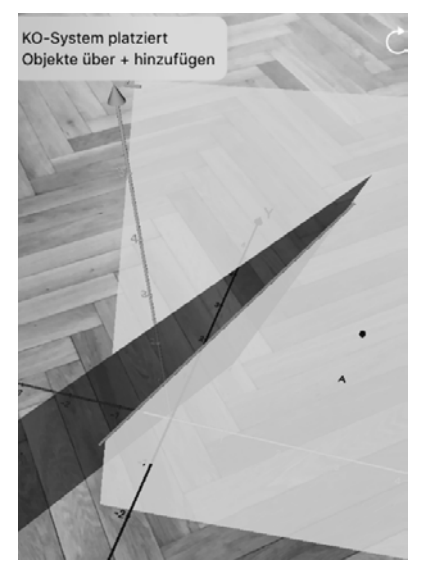
Figure 2. Screenshot of the AR-App representation of the solution. E_1(dark grey) , E_2(pale) , intersecting line g and point A.

The AR-App visualizes the given information "walk-on-able" within the smartphone's camera image by virtually adding a three-dimensional fixed coordinate system. An input area is provided to type in E_1 and A (Figure 3 left). After having calculated the solution by hand, the learner can type in his solution (Figure 2, Figure 3 right) and visually check its correctness by exploring the situation from different views changing the camera perspective through body movement.