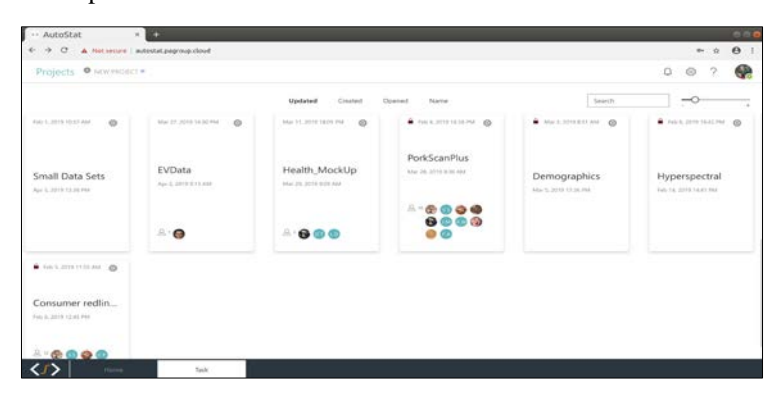
Figure 1 .The Project Menu shows all current projects and members. Project sharing is allocated by the project owner, who may elect to share a copy and nominate sharing permissions. The account administrator can restrict access to non-required modeling or other modules to prevent account overuse.

A key feature of AutoStat for teaching is the logical flow provided in the user interface. The sequence provided in AutoStat begins with the Project Menu (Figure 1), where students will be able to organize their projects, and collaborate through the share facility when doing group work. The Task Menu (Figure 2) then provides a clear set of procedures available within the software, namely data management, visualization, model building, result summaries and report builders.