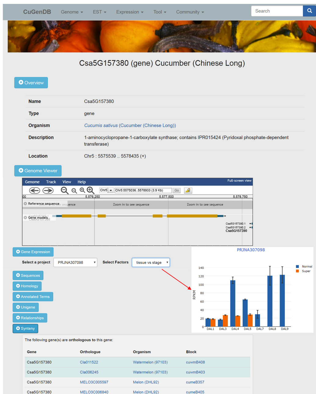
Figure 1. Gene feature page in CuGenDB. The page contains different sections with different content types. The inset histogram shows expression profiles of a specific gene under a selected project in the 'Gene Expression' section.

set, gene functional descriptions assigned by AHRD, GO terms assigned by Blast2GO, and enzyme commission (EC) numbers derived from the top hits in the UniProt database are integrated into a file in the PathoLogic format, which is used by PathwayTools for pathway prediction. A total of 320–430 biochemical pathways have been predicted from each genome or unigene set. A cucurbit biochemical pathway database (CucurbitCyc) has been implemented in CuGenDB using the PathwayTools web server (31). Users can search and browse the predicted pathways, as well as perform comparative and omics data analyses through the CucurbitCyc database.