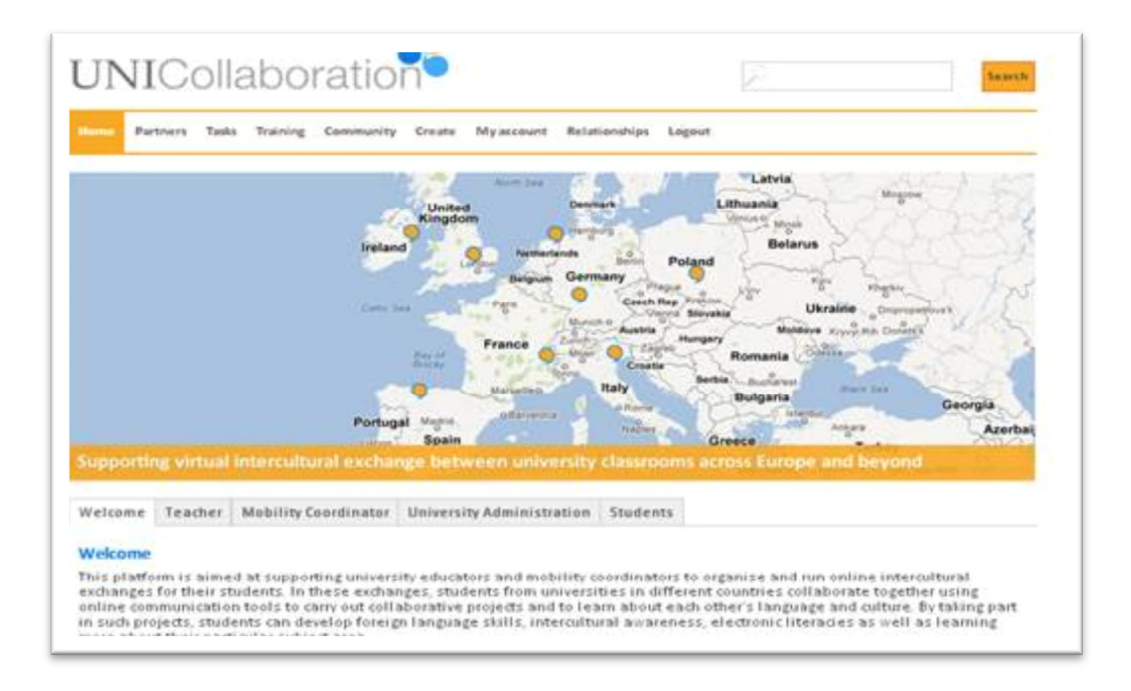
Figure 2. Homepage of the INTENT online platform.