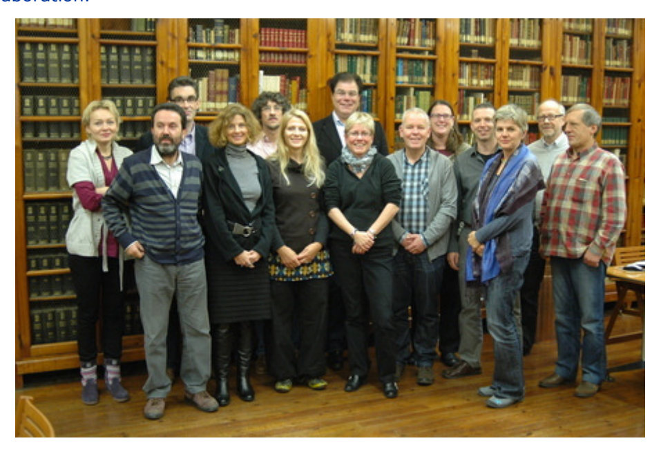
Figure 1. The INTENT team at their kick-off meeting at the University of León, Spain.

By achieving these aims, the project team hopes to increase the number of students, educators and decision makers who are aware of the benefits of telecollaboration and who will consider integrating it into their educational activities. The next part of this paper focuses on the European survey and collection of case studies which the team carried out in order to establish a clear overview of the levels of use of telecollaboration across European universities, and to identify practical barriers to the take-up of telecollaboration.