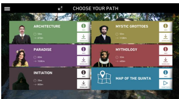
Figure 5: Main screen of Regaleira 4.0, featuring the 5 tours available at Regaleira 4.0 app.

The AR experiences are enriching because they offer additional information about the different sites, their history and symbology, and some of them are also ludic (Figs. 8 and 9). They are also interactive because when a visitor approaches a place where an experience is available, the smartphone receives a notification signalling it, sent from beacons strategically placed throughout the cultural heritage site. These experiences are varied and diversified, ranging from objects and statues that come to life to explain details about themselves, to historic figures who narrate their connection to the place, to the observation of reconstitutions of religious and symbolic rituals.