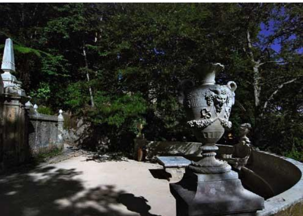
Figure 4: Waterfall lake.

In 1987, the estate was sold, once again, to the Japanese Aoki Corporation and ceased to serve as a residence. The corporation kept the estate closed to the public for ten years, until it was acquired by the Sintra Town Council in 1997. Extensive restoration efforts were promptly initiated throughout the estate. It finally opened to the public in June 1998 and began hosting cultural events. In August of that same year, the Portuguese Ministry of Culture classified the estate as "public interest property". The Regaleira Palace will be the same name as the entire estate. The structure's façade is characterized by exuberantly Gothic pinnacles, gargoyles, capitals, and an impressive octagonal tower.