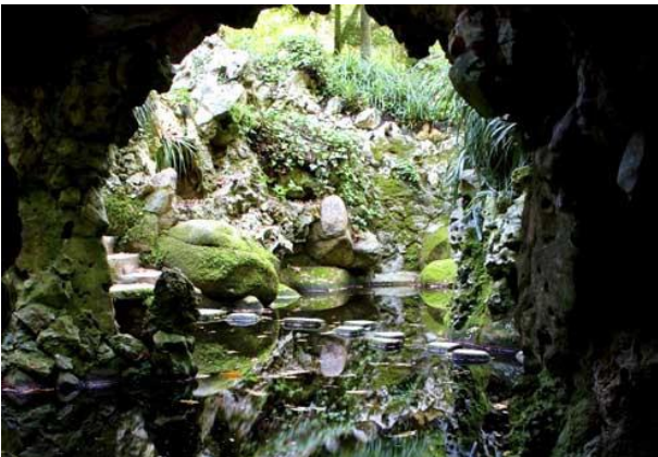
Figure 3: Fountain of Abundance.