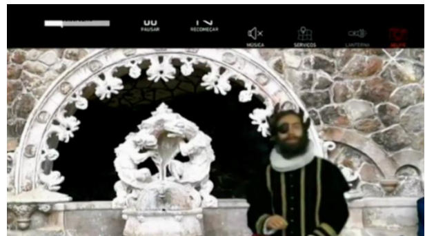
Figure 7: Example of video with 3D agent: poet Luís de Camões explains the symbolism of the decorations and figures in a fountain.