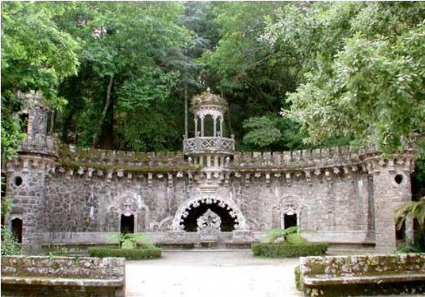
Figure 2: Portal of the Guardians.