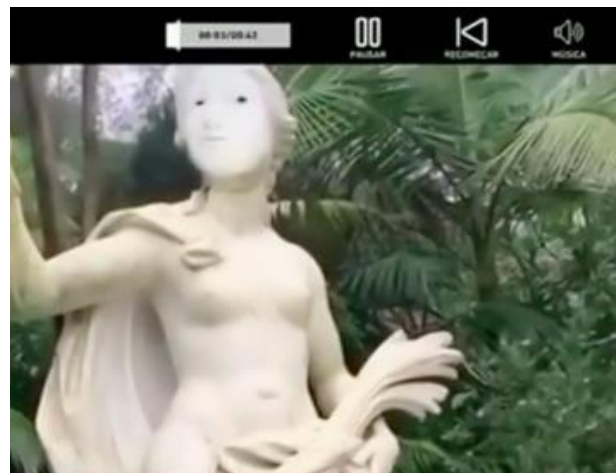
Figure 8: Example of AR experience: a statue comes to life to explain her identity –it is a muse– and symbolism.