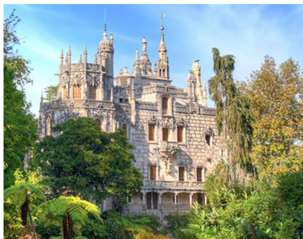
Figure 1: Overview of Quinta da Regaleira.

Quinta da Regaleira is an estate located near the historic center of Sintra, Portugal. It is classified as a World Heritage Site by UNESCO within the Cultural Landscape of Sintra (Fig. 1).