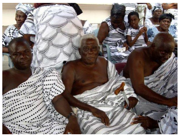
Figure 1. Picture from a family reunion, shared online