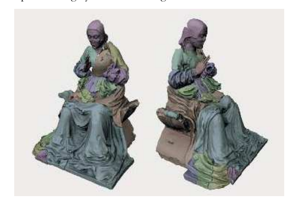
Fig. 4: The digital assembly of the Madonna of Pietranico from the digitized fragments (image above) and the design of the two supporting elements (head and bust) created as digital shapes and then constructed using rapid prototyping for the real assembly.

set) is highly complex in the physical space. Restorers perform this action either by gluing/fixing the fragments or by building specific supporting structures. Moreover, the rehearsal and assessment phase cannot be done by just considering a subset of the pieces; we should build the entire puzzle to have a global view and a solid assessment of the hypothesis, which makes the job even more complicated. This makes reassembly a really complex and highly time consuming task.