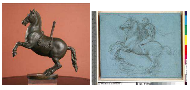
Fig. 2: We used geometric processing to estimate the shape similarity between two artworks, a bronze horse statuette and a drawing, and to find evidence for a new attribution hypothesis.

An example of a shape comparison project concerned the evaluation of the attribution of a bronze horse statuette, conserved at the National Archeological Museum in Florence and attributed to Benvenuto Cellini (DELLEPIANE et al. 2007). The goal here was to find some numerical shape-based evidence to the similarity noticed with a Leonardo's metal-point drawing (RLW no.12358, Windsor Royal Collection). We confronted the two artworks by devising a shape-matching experiment between the 3D-scanned model of the bronze horse and the digitized 2D drawing (see Figure 2). The shape comparison was based on a technology that allows register a photo (or a drawing, as in this case) on a 3D model, following tightly the perspective projection rules. The results of the matching were extremely good, demonstrating that the drawing could have been produced from the bronze statuette by using some sort of camera obscura from two different points of view (the horse body and three legs in the drawing come from a first orientation, while the front-most leg and the head are traced according to a second position).