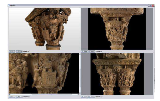
Fig. 1: The CENOBIUM web system, supporting visual access to medieval cloister sculptures. The web page presenting the data available for the single capitol is presented in the image above, while an interactive inspection session (three photographs and a 3D model) is in the image below.

An example of a shape comparison project concerned the evaluation of the attribution of a bronze horse statuette, conserved at the National Archeological Museum in Florence and attributed to Benvenuto Cellini (DELLEPIANE et al. 2007). The goal here was to find some numerical shape-based evidence to the similarity noticed with a Leonardo's metal-point drawing (RLW no.12358, Windsor Royal Collection). We confronted the two artworks by devising a shape-matching experiment between the 3D-scanned model of the bronze horse and the digitized 2D drawing (see Figure 2). The shape comparison was based on a technology that allows register a photo (or a drawing, as in this case) on a 3D model, following tightly the perspective projection rules. The results of the matching were extremely good, demonstrating that the drawing could have been produced from the bronze statuette by using some sort of camera obscura from two different points of view (the horse body and three legs in the drawing come from a first orientation, while the front-most leg and the head are traced according to a second position).