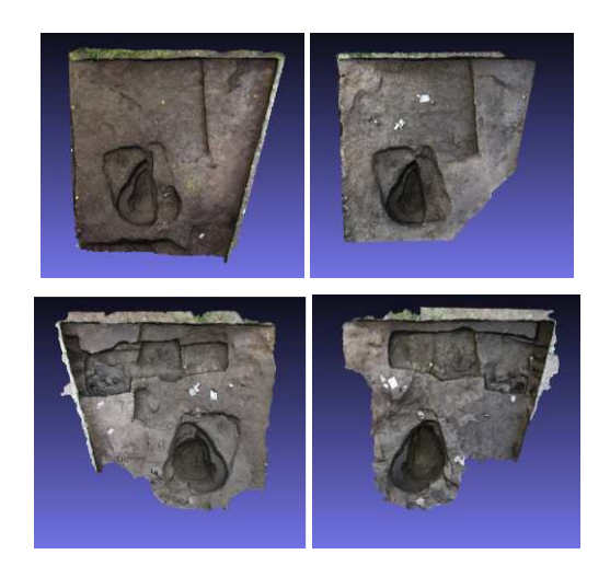
Fig. 3: Four different 3D models showing the progress of an excavation (3D models produced with Arc3D and MeshLab).

Archaeology has been a pioneering domain for the use of digital technologies. Excavations require a sophisticated representation of the destructive digging process and of its intermediate results and findings. This originated, first, the use of Data Base Management technologies and, later on, an early adoption of Geographic Information Systems. In this domain, digital representations have been based so far mostly on 2D or 2D 1/2 spaces. Very few are the experiences so far going towards a real 3D documentation of the excavation process and of its findings.