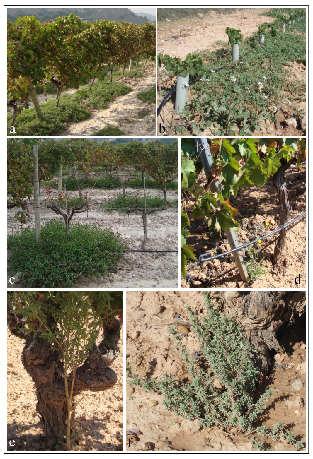
Figure 1.- Weed species in grapevine rootstock mother fields, openroot field nurseries and commercial vineyards. A/ Several weed species growing in a commercial vineyard; B/ Amaranthus blitoides and Diplotaxis erucoides in a young vineyard; Weeds growing close to grapevine plants: C/ Echinocloa crus-galli; D/ Sonchus oleraceus; E/ Bassia scoparia and F/ Amaranthus blitoides